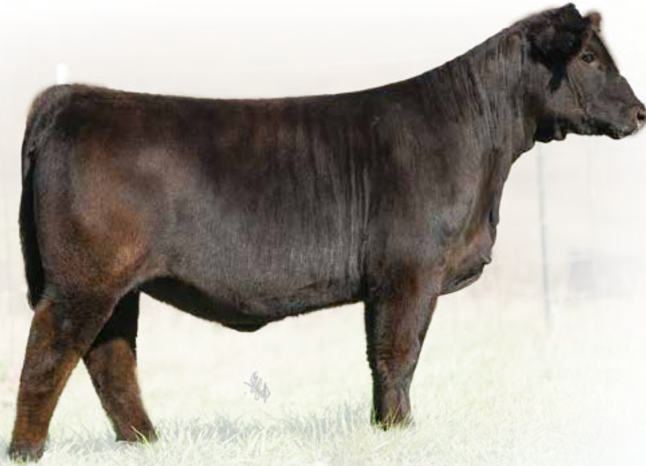
Lot 11 RUBY NFF RHYTHM 904G