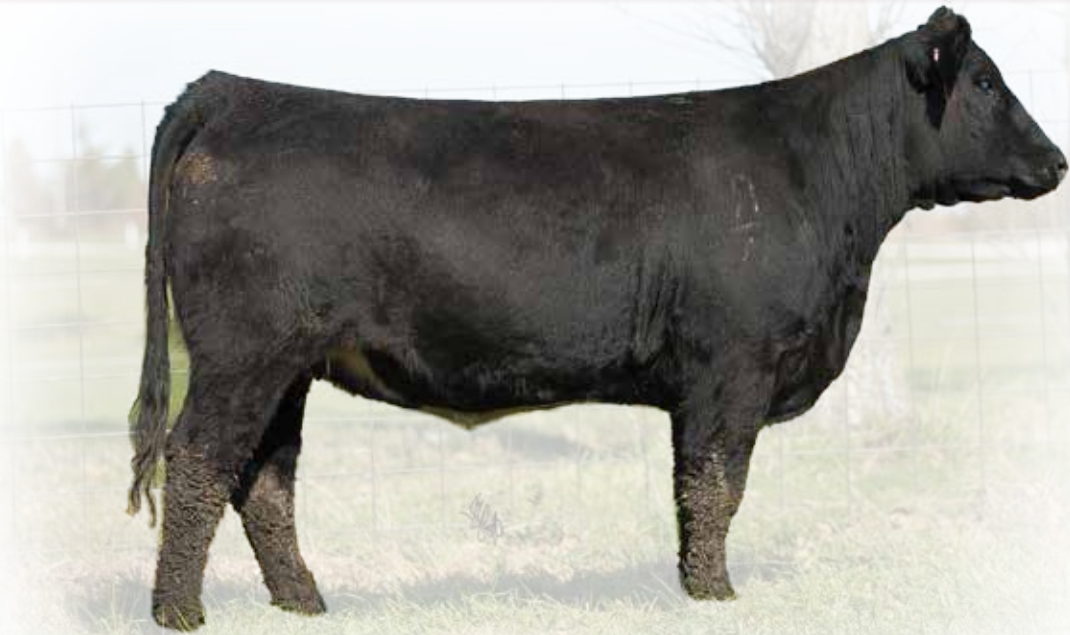
Lot 42 RUBY NFF RHYTHM 858F

A super stout made Pays to Dream daughter here backed by the great 2123Z donor. We should be keeping some of these from this mating for ourselves, but we need to part with some good ones as well. Our Pays To Dream females have really done an outstanding job in our operation. This female has a little cloudiness in her left eye from an injury post weaning last year. Vision does not seem affected whatsoever.