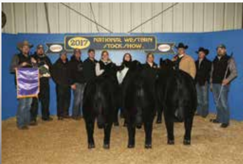
2017 Grand Champion Pen of Three