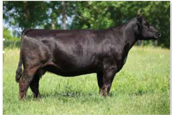
Daughter of Lot 25 - JSF FIREFLY W46