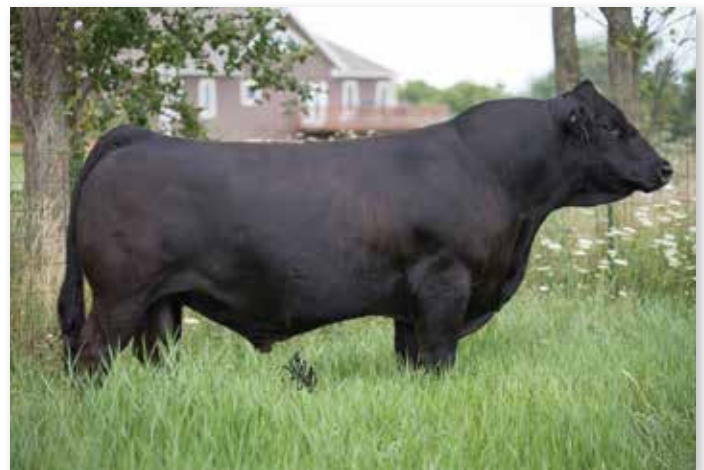
Sire of Lot 47 RUBYS ABLSOLUT 371A

AI BRED ON 7/11/19 TO RUBY C-D ALL AROUND 534E. ESTIMATED DUE 7/11/20.