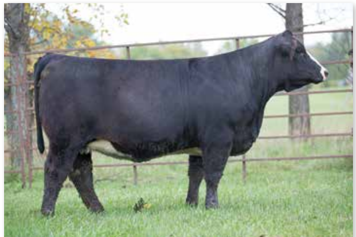
High Selling Bred 2018 Lavin The Dream Production Sale and Full Sister to Lot 34 - RUBY SWC YETTI E760