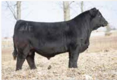
Sire of Lots 27 & 28 RUBYS TURNPIKE 771E