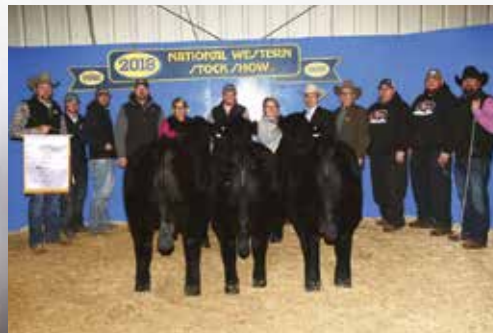
2018 Res. Grand Champion Pen of Three