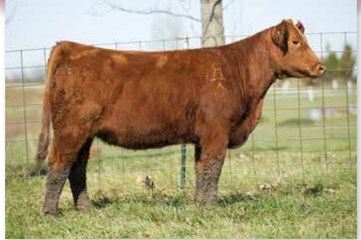
Lot 47 RUBYS RHYTHM 8195F

AI BRED ON 5/22/19 TO W/C DOUBLE DOWN 5014E. ESTIMATED DUE 2/27/20.