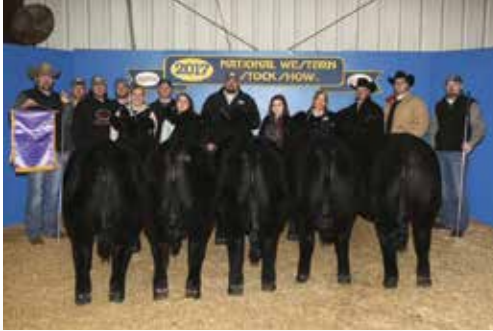
2017 Grand Champion Pen of Five