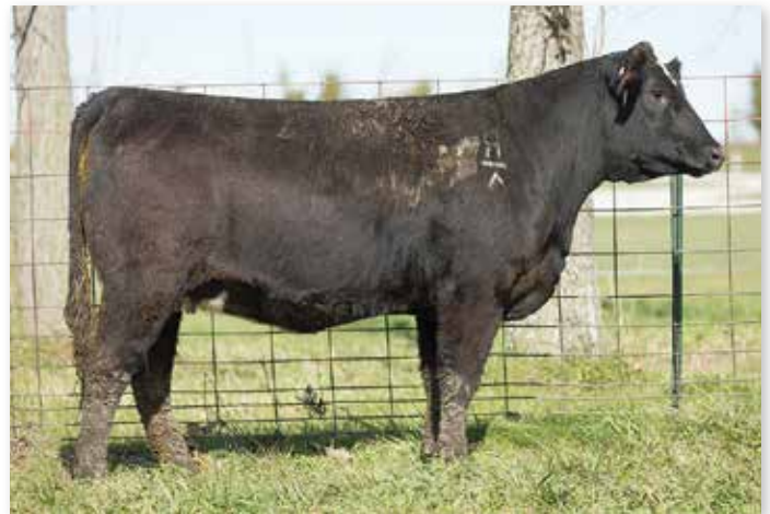
Lot 38 RUBY NFF LASS 8183F

AI BRED ON 4/24/19 TO HOOK'S ENCORE 65E. ESTIMATED DUE DATE 1/30/20.