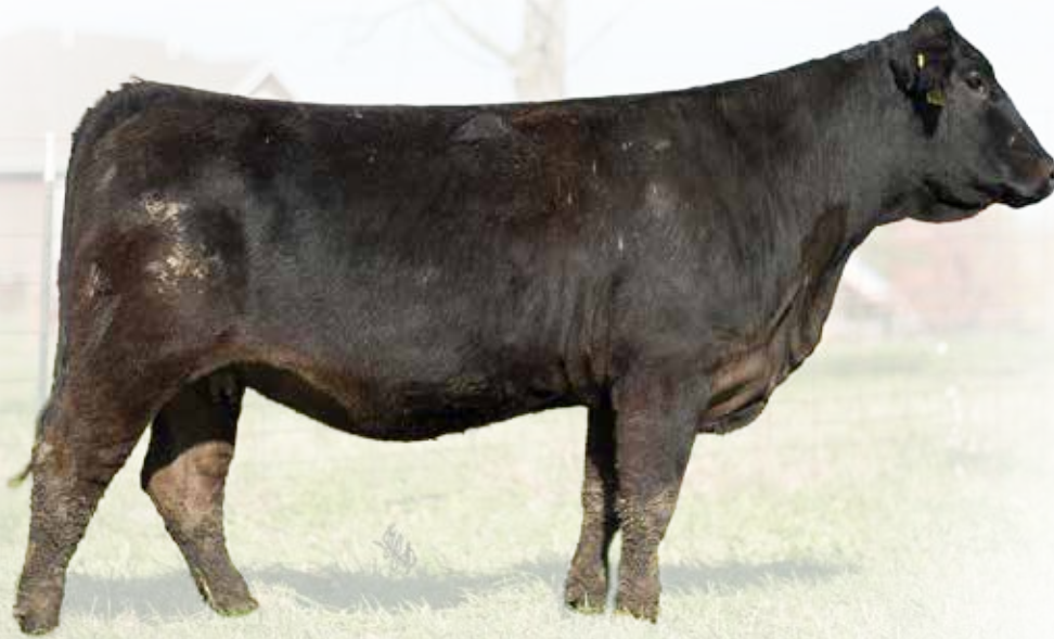
Lot 60 RUBYS KAYE 7E100

We leased the sire of this female to cover our fall cows and then purchased him this spring to run on a group of cows. He is a Dew It Right out of a full sister to Excalibur. We love the calves and here is a good one out of an Ever Ready cow. AI BRED ON 6/10/19 TO RUBY C-D ALL AROUND 534E. ESTIMATED DUE 3/17/20.