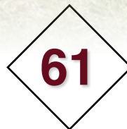
RUBYS LUCY 838F

Homozygous Black | Homozygous Polled | PB SM