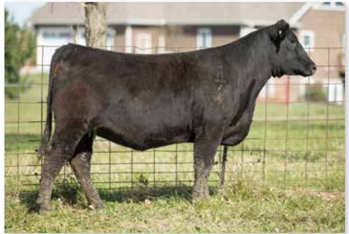
Lot 37 RUBY NFF LUCY 8174F

AI BRED ON 5/26/19 TO RUBY C-D ALL AROUND 534E. ESTIMATED DUE DATE 3/2/20.