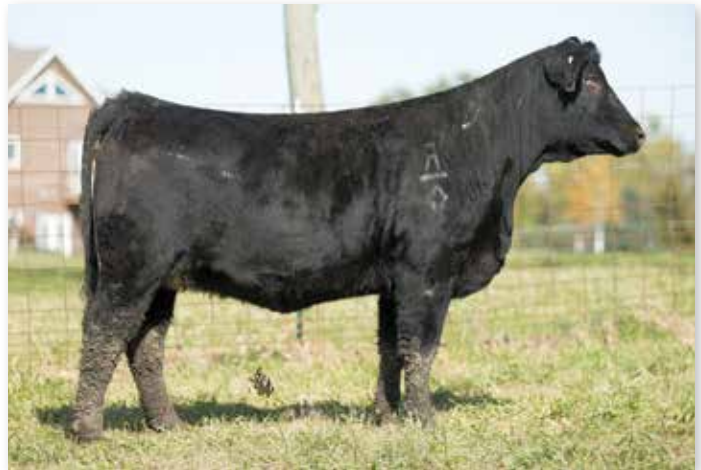
Lot 53 RUBYS MISS CLEO 8153F

AI BRED ON 6/25/19 TO RUBY C-D ALL AROUND 534E. ESTIMATED DUE 4/1/20.