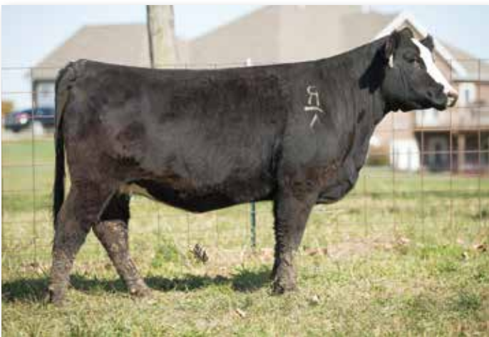
Lot 41 RUBY NFF ERICA 8199F

AI BRED ON 6/15/19 TO RUBY C-D ALL AROUND 534E. ESTIMATED DUE DATE 3/22/20.