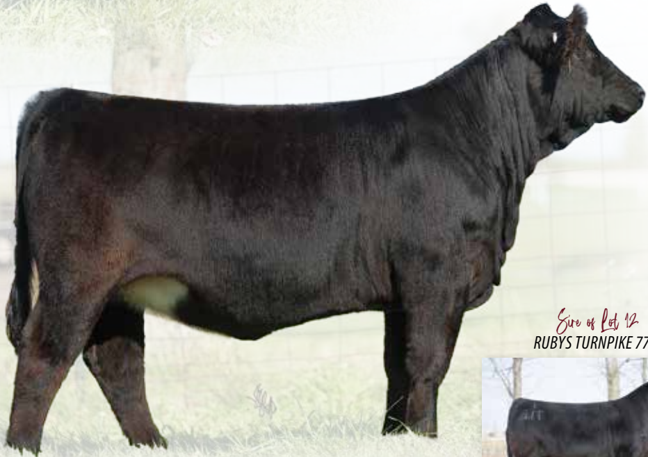
Sire of Lot 12 RUBYS TURNPIKE 771E

What an exciting female with an exciting pedigree here! Here is 2124Z's natural calf out of the great Turnpike. If you like one with extra stoutness and substance, this one will be right up your alley. We love the center dimension and mass that this one brings to the table and if you want your show heifers to raise herd bulls when they are in production, here is one that will get the job done. The guesswork is done with this one.