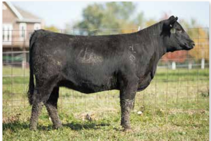
Lot 54 RUBY JG MISS CLEO 866F