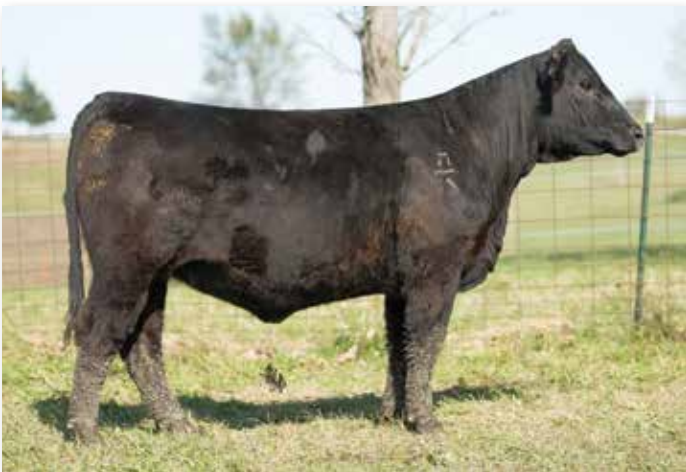
Lot 45 RUBYS RHYTHM 863F