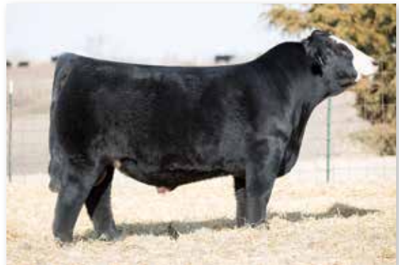
Maternal Brother to Dam of Lot 22 - RUBY/SWC GENTLEMAN'S JACK