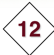
RUBY NFF RHYTHM 975G

Homozygous Black | Homozygous Polled | PB SM