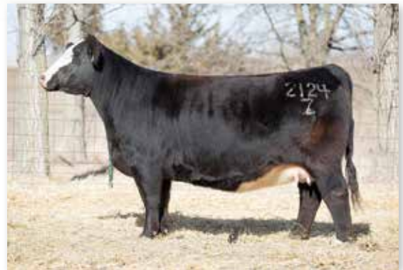
Donor of Lot 1 - RUBY NFF RHYTHM 2124Z

Without a doubt, one of the most unique creatures to come out of Murray, IA. We have been fortunate to raise some really good heifers over the years, but I don't remember one that has intrigued me more than this one does. Backed by the elite 2124Z donor and out of the exciting Currency stud, there are several generations of Ruby bred cows backing this sale feature. We challenge you to find a purebred with this much body depth and capacity that still has a killer look and combines that with so much flex and cushion on both ends of her skeleton. Her phenotype will stop you in your tracks, but imagine her value when you put her in production. She is essentially an outcross to many sires and the we have proven time and time again the Rhythms can produce as well as any cow family in the breed. Opportunities like this one don't come around everyday. If you are looking for an elite show prospect and a donor capable of moving you up a tax bracket, your looking at her right here.