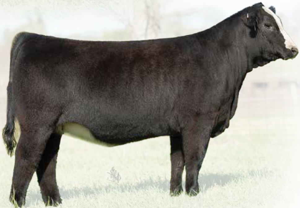
Lot 8 RUBY NFF RHYTHM 6144