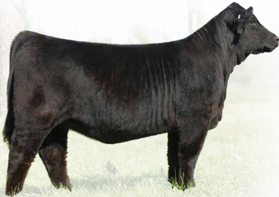
Lot 9 RUBY NFF RHYTHM 972G

Here is a result of one of the most predictable mating's we've had here. Several high sellers, show winners, and now donor cows have this same pedigree. This females recip mother didn't do the best job, but if you look at all the parts here, we hope you can see the same potential here as we do. Make sure to find this one, she can make an impact in any herd!