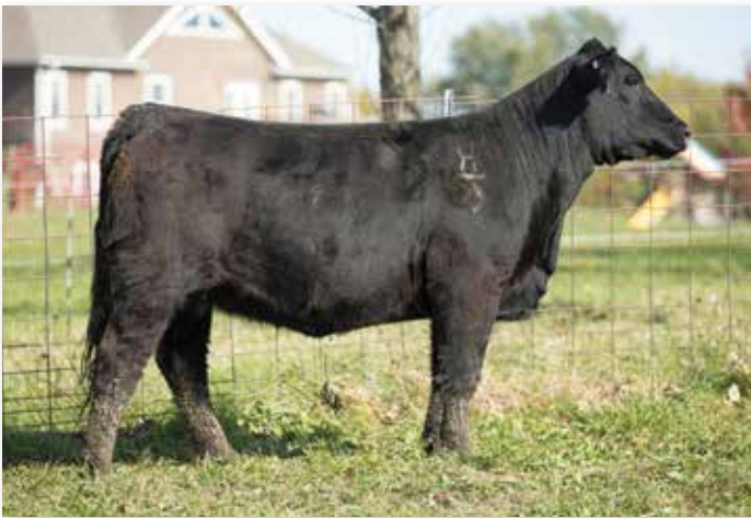
Lot 46 RUBYS RHYTHM F865