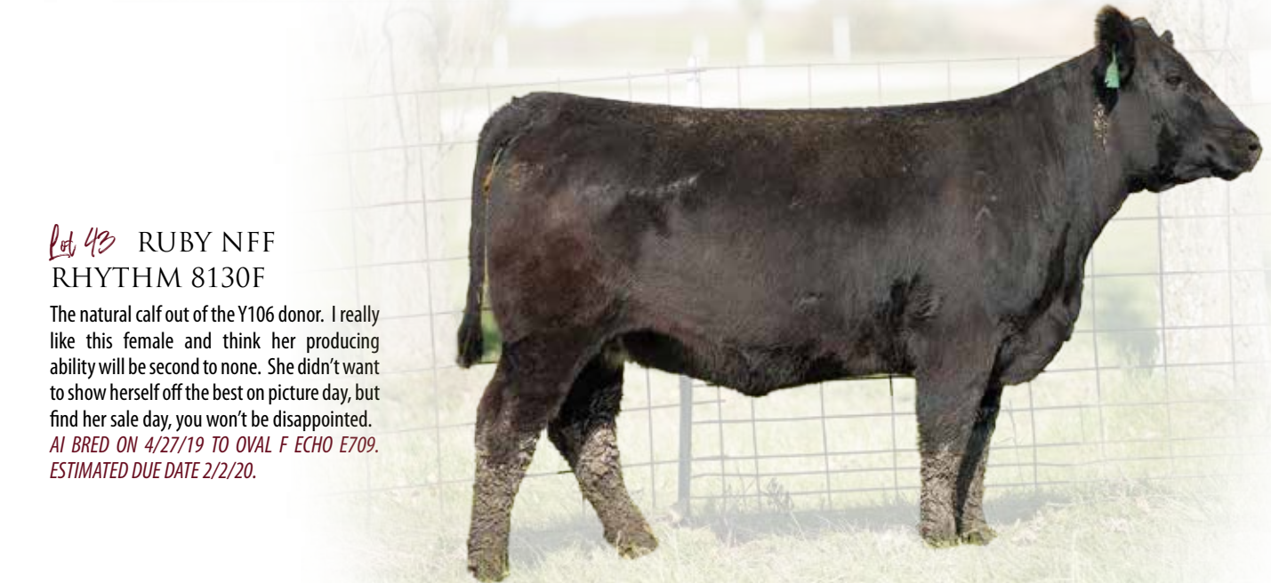
Lot 43 RUBY NFF RHYTHM 8130F

AI BRED ON 4/24/19 TO HOOK'S ENCORE 65E. ESTIMATED DUE DATE 1/30/20.