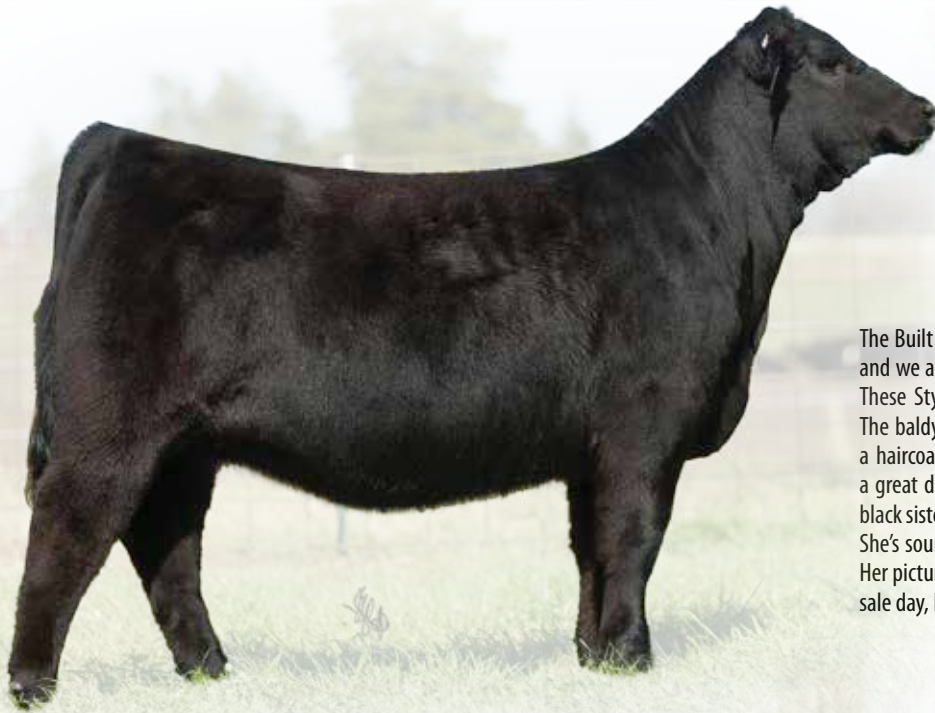
Lot 7 RUBY NFF RHYTHM G471

The Built Right females have proven their worth over the years and we absolutely love this daughter out of the immortal 418P. These Style sired sisters are sure to get your blood pumping. The baldy sister is a monster bodied, sound made female with a haircoat better than most club calves. She also comes with a great disposition suitable for a first time exhibitor. The solid black sister is one that we think can compete at the highest level. She's sound as a cat, big bodied, cool looking and great haired. Her picture doesn't quite do her justice, so make sure to find her sale day, I promise you won't be disappointed.