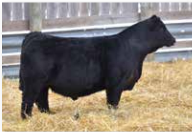
Sire of Lot 15 CDI CEO 281D

A great example of what Style daughters can do in production. Here is a huge middled, loose structured female by the performance king, CEO. Her granddam is the great K18 donor that has left a legacy here. Here is a fresh pedigree on the top side combined with solid foundation genetics on the bottom side.