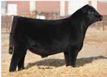
Sire of Lot 5 & 6 SILVEIRAS STYLE 9303