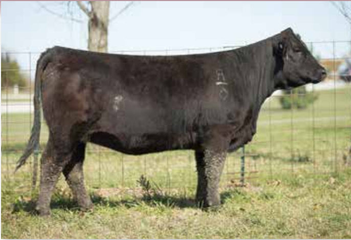
Lot 44 RUBYS RHYTHM 877F