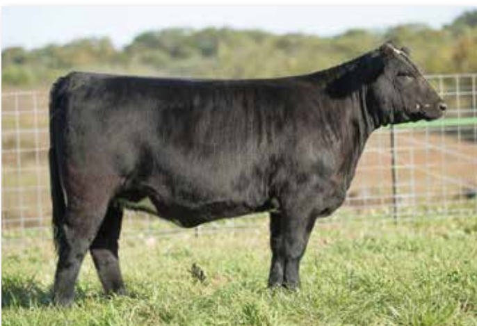
Lot 33 RUBYS RITA 8F18