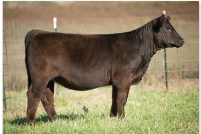
Lot 20 RUBYS LADY 9148G

We love when purchased genetics make a big impact right away, and that is exactly what the dam of this heifer has done. She was purchased out of the first Dreamworks sale hosted by our friends at Nelson Family Farms. This younger Battle Cry female is one of my favorite purebreds. She is one that may not blow you away in any one area, but try and find a hole in her and you will be hard pressed to do so. Cool looking with balance. Have some patience while this one matures and you will be rewarded, she's a good one!