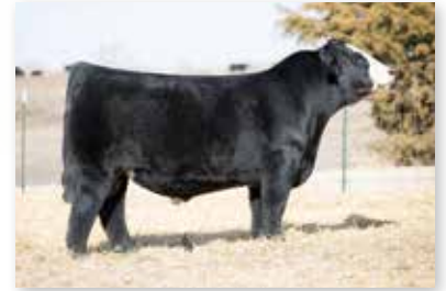
Sire of Lot 29 RUBY/SWC GENTLEMAN'S JACK

The Gentleman Jack's took this sale by storm last year and went on to do some big things. This heifer will be no different. This cool looking baldy female is one of the boldest sprung, biggest bodied females in the entire offering. She has a great look and square and correct in her lines. She is backed by the great Magnetic Lady donor cow as well. Buy with confidence here!