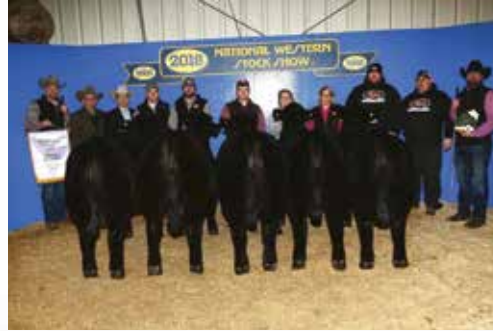
2018 Res. Grand Champion Pen of Five