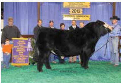
Sire of Lot 46 BROKER