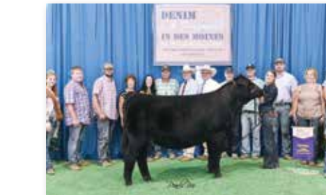
Dam of Lot 54 RUBYS MISS CLEO 598C

AI BRED ON 6/5/19 TO RUBY C-D ALL AROUND 534E. ESTIMATED DUE 3/12/20.