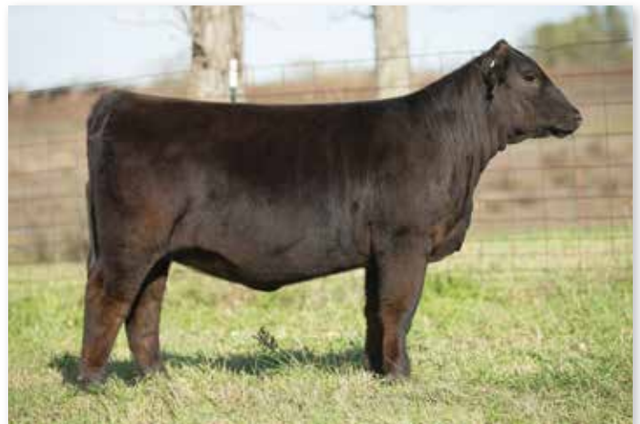
Lot 21 RUBYS ANNIE 9142G

Another Battle Cry female out of a Dreamworks purchase. Out of an extremely nice Yukon dam. Yukon was a Built Right x 418P that left some awesome daughters. Another later maturing female here with all the parts to be a killer bred heifer. Another one we like really well.