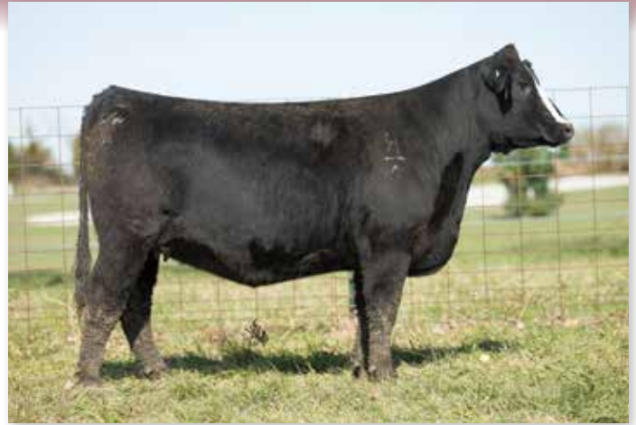
Lot 36 RUBYS JUANADA 8173F

AI BRED ON 5/5/19 TO HOOK'S ENCORE 65E. ESTIMATED DUE DATE 2/10/20.