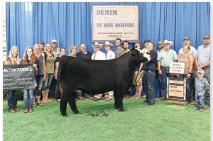
Daughter of Lot 2 - RUBY NFF RHYTHM 4B1 2016 AJSA SUMMER CLASSIC RESERVE GRAND CHAMPION PUREBRED SIMMENTAL