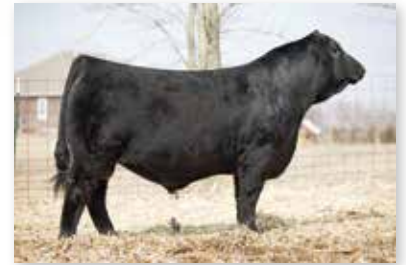
Sire of Lot 23 - OVAL F ECHO E709

Echo was a herd bull purchase from Oval F Ranch last spring, and we love what he is doing here. He may have the biggest, best shaped feet that I have ever seen on a Purebred bull. He may also be the flattest shouldered bull in relation to amount of center dimension he has as well. This daughter sure exemplifies those traits. Monster feet, big boned, flat shouldered, stout made, lots of middle, and a great hair coat. Manage this ones front end and she can have a very successful show career. Put her in production and she has the ability to anchor a donor pen. I have really admired this heifer all along.