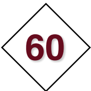
RUBYS KAYE 7E100

AI BRED ON 4/24/19 TO HOOKS ENCORE 65E. ESTIMATED DUE 1/30/20.