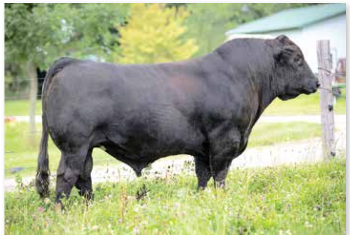
Sire of Lot 59 - PVFS RUBY MADDEN 126Y

Very complete female here. One of the last Madden daughters that will ever sell. AI BRED ON 4/26/19 TO OVAL F ECHO E709. ESTIMATED DUE 2/1/20.