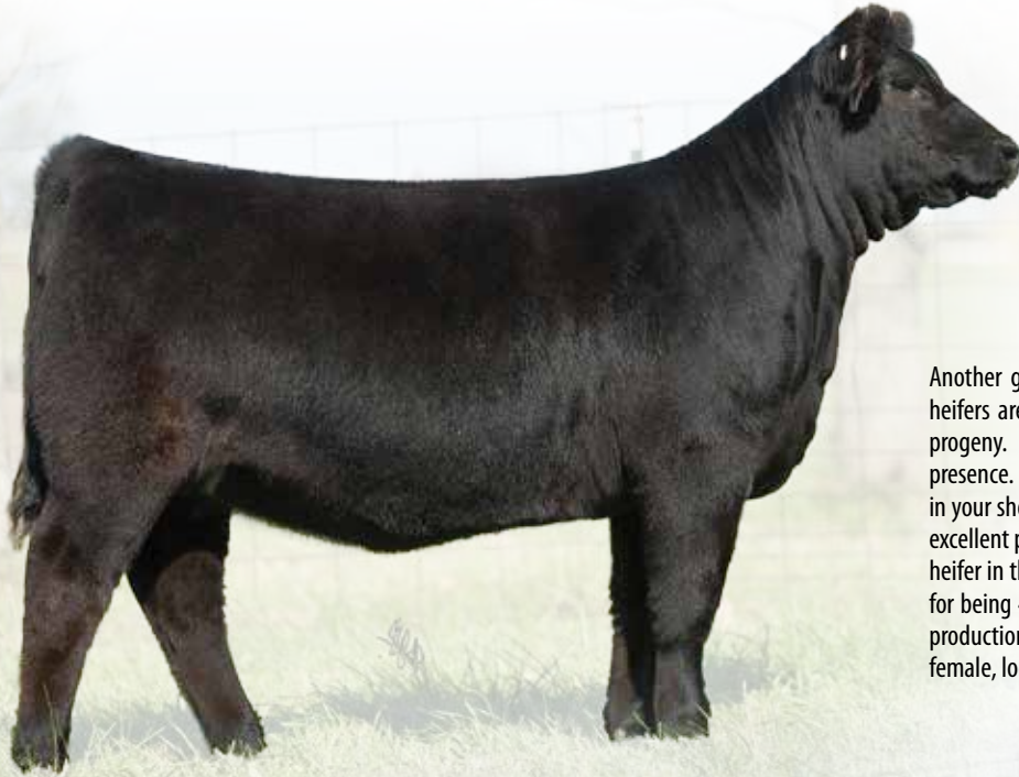
Lot 5 RUBY NFF RHYTHM 971G

Another great set of flush mates out of the great 2124Z. These heifers are what the industry has come to expect from the style progeny. Great looking, big bellied, loose structured and superior presence. They are great haired and are ready to make an impact in your showstring. The Style daughters we have in production are excellent producers. A Style x 418P daughter raised the high selling heifer in this sale a couple years back. 2124Z presents a great case for being 418P's greatest daughter, so you know they will work in production as well. If you're looking for a competitive SimAngus female, look in at these girls.