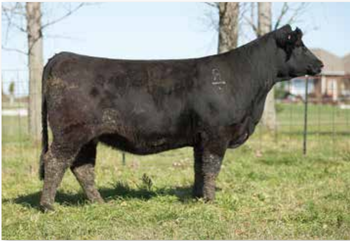
Lot 63 RUBYS FIREFLY F818

AI BRED ON 5/24/19 TO OVAL FECHO E709. ESTIMATED DUE 3/1/20.