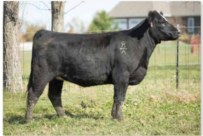
Lot 48 RUBYS RHYTHM 7E23

AI BRED ON 5/11/19 TO OVAL F ECHO E709. ESTIMATED DUE 2/16/20.