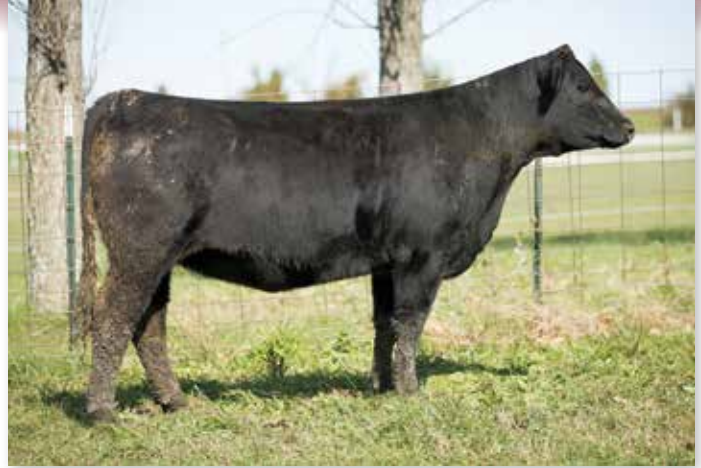
Lot 52 RUBYS KAREN F812

AI BRED ON 6/11/19 TO RUBY C-D ALL AROUND 534E. ESTIMATED DUE 3/18/20.