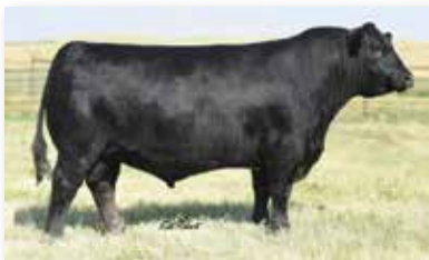
Sire of Lot 24 CCR PAY DIRT 2340C

This mating has proved to be slam dunk. We sold a full sister on our fall born online sale this spring to Chi Swain of Kentucky that was very nice, and we have 2 fall born full brothers that are standouts in their pen. This heifer has bull producer written all over her pedigree, but when you look at her, she screams show heifer. Another outstanding dual-purpose prospect that can add value to the most discriminating program.