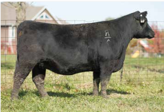
Lot 64 RUBYS BIRTHSTONE 869F

AI BRED ON 5/13/19 TO W/C DOUBLE DOWN 5014E. ESTIMATED DUE 2/18/20.