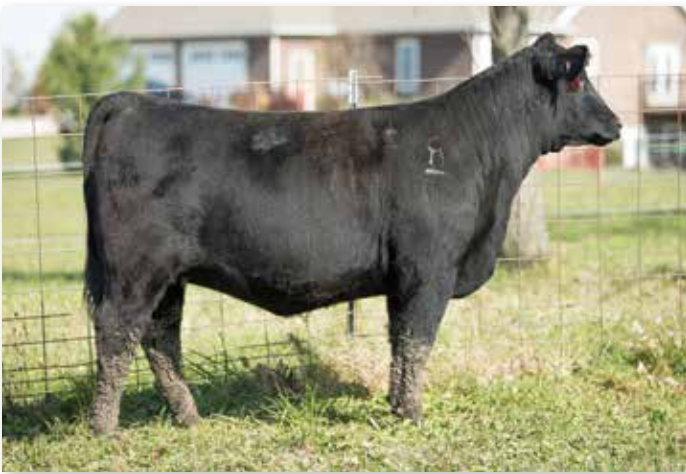
Lot 40 RUBYS ELINE 8193F

AI BRED ON 6/25/19 TO RUBY C-D ALL AROUND 534E. ESTIMATED DUE DATE 4/1/20.