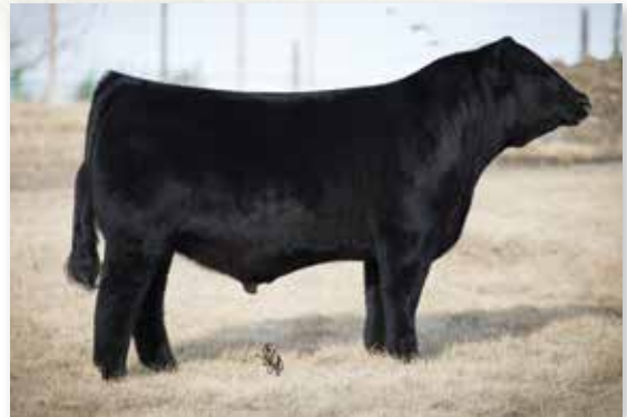
Maternal Brother to Dam of Lot 22 - RUBY SWC BATTLE CRY 431B

One of my favorite purebreds in the offering. This is an exciting mating that combines fresh, outcross genetics with a proven, breed leading cow family. We made the decision to retain this heifers dam last fall and sure glad we did. This first calf has proven her worth and has us excited for the future. Study this female when you get to see her. She is monster footed, big boned, yet clean and loose jointed. She is long and extended through her front, flat shouldered, and opens up into a big center body. Get behind her and she is powerful, yet smooth in her muscle makeup. She has a quiet demeanor, and may not show herself off as much as some, but take some time and study her, and we know you will like what you see. Study her pedigree, the mating opportunities are virtually limitless and her EPD profile is impressive to say the least. Don't miss out on this one!