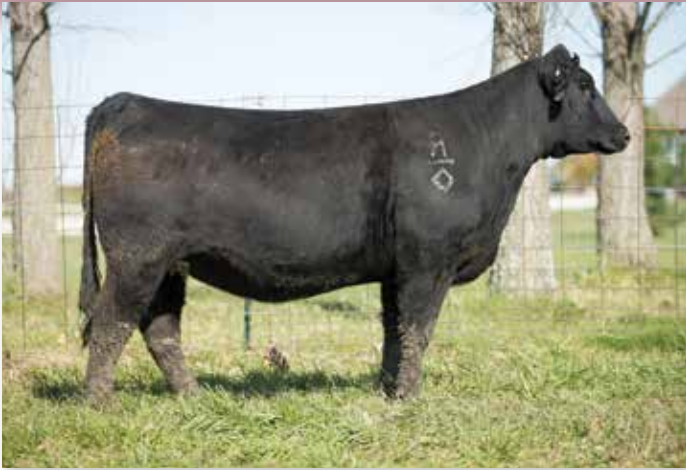
Lot 39 RUBY NFF LASS 8180F