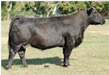
Maternal Granddam to Lots 29 and 30 SVF NJC MAGNETIC LDY M25

If you're looking for a cobra necked purebred female, look no further! You won't find one any better looking than this one and she combines those great looks with a great set of feet and legs. She came from our recip herd later than some and was a bit skinny at picture time. Makes sure you find her sale day, she has really poured it on lately and we are loving how she is maturing.