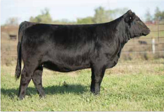
Lot 31 RUBYS JUANADA 8F54

We've admired these fall born Gentleman Jack daughters all summer long and thought it was a shame that they weren't in someone's show barn, so we decided to offer them in this sale. I love the added look that they offer with extra body depth and squareness. They are very well balanced females that are correct in their design. The dams of these heifers are 3 of the nicest cows in our fall calving herd. If you want a great foundation to build on, pick 1, 2, or 3 of these sisters, I promise they will not disappoint.