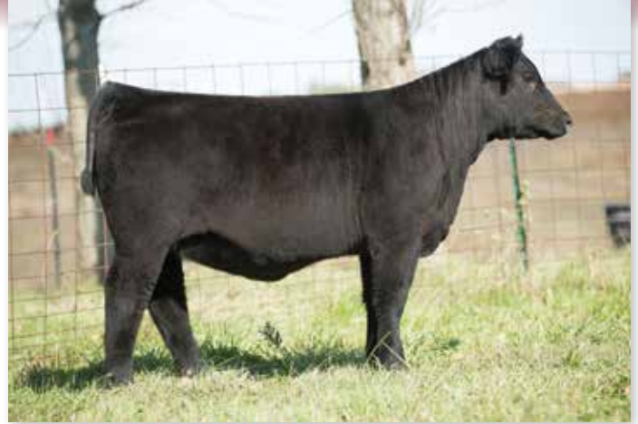
Lot 19 RUBY CF BLACKBIRD 9108G

Heifers like these are why we keep using Battle Cry so hard. A killer look combined with lots of body and extra stoutness. If you trace this ones pedigree, you will find one of the best looking Meyer 734 daughters I have seen. What this one lacks in tail length gets made up for by everything in front of it.