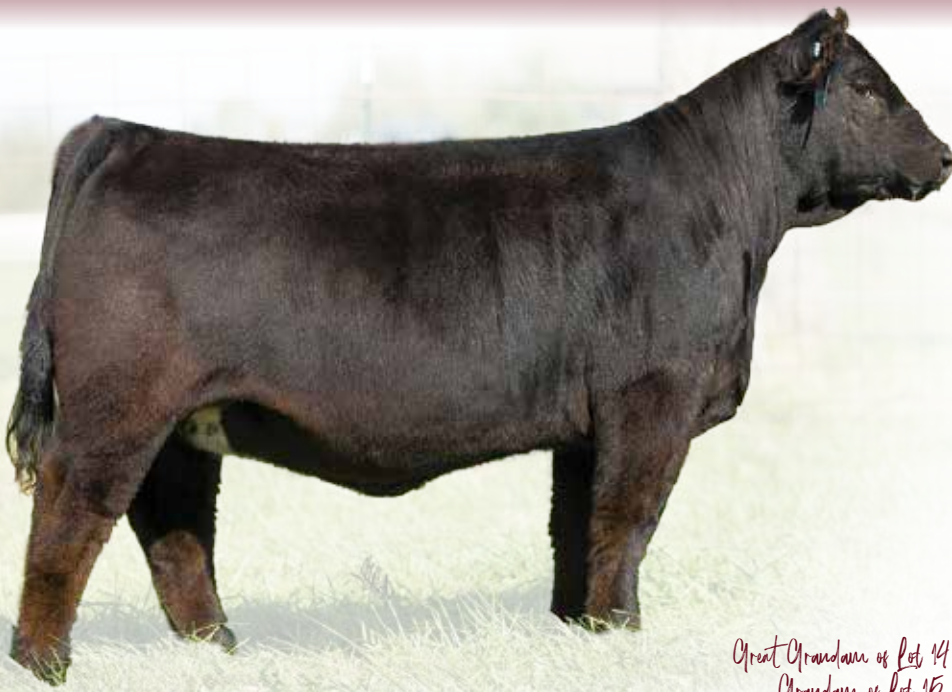
Lot 14 RUBY NFF RHYTHM 968G

If you have been paying attention, there is a big push in the club calf world for more breed steers. Here is your donor to raise Simmental show steers!! One of the most unique females in the entire offering. She is stout featured everywhere: feet, bone, body, top, quarter, muzzle. You name it and she is big there. I think you can show her different ways if you want, sound and flexible enough to be a breeding heifer, stout enough to be a market heifer. She combines her unique traits with a great disposition as well. Get this one bred early, aspirate her, reverse sort her for those half-blood steers and sell them high! Don't miss out!