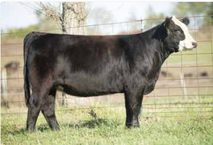
Lot 32 RUBYS ARKDALE PRIDE 8F23