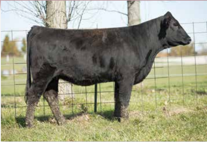
Lot 62 RUBYS COWGIRL BABY 7E59