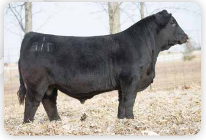
Rubys Turnpike 771E - Sire of Lots 1 - 10