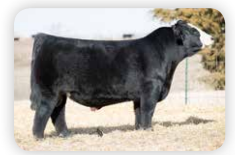
Ruby/SWC Gentleman's Jack - Sire of Lots 67 - 69

The Gentleman Jack bull himself was a past sale topper through this very ring, and we have been impressed with the quality of his offspring. They start small, and are a bit later maturing and now that we know that, we will have several more for next years sale. These bulls are all cut out of the same cloth. They are smooth made, big bodied bulls that have that extra eye appeal that adds value however you market your calves. We love the feet on these Gentleman Jacks as well. The 952G bull had a poorer recip cow and had a rough start, but if you can look past that, we hope you can see a high quality, baldy purebred bull that is as neat made as any in the sale.