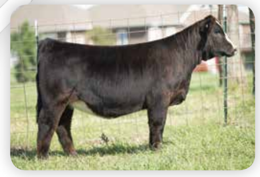
Ruby NFF Rhythm 9115G - Full Sister to Lots 48 & 49