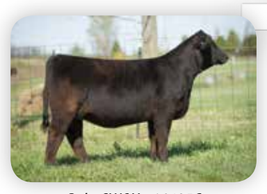
Ruby SWC Yetti 9125G Maternal Sister to Lots 62 & 63

These two flush mates are the result of one of the most successful flushes here to date. We have sold two heifer sibs and they found their way to reputable breeders herds of Swain Select Simmentals and Moriondo Farms. The consistency of these two brothers is what you hope for in a flush. They are great at the ground with great feet shape and size. They are attractive, stout made, big bodied, athletic bulls that combine phenotype with a very balanced and performance oriented EPD profile. They are direct sons of the Yetti 143Y cow that is as good of herd bull producing cow as any in the breed. They are 3/4 blood Simmentals, but are strongly Angus influenced in their features. If you have always used Angus bulls and been on the fence about jumping on board the Simmental train, these would be a great place to start. These are the kind of bulls than can go to work anywhere.