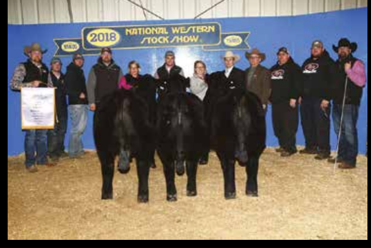
Reserve Champion Pen of 5 Simmental Bulls