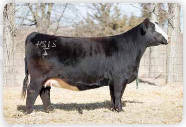
Ruby NFF Rhythm 2124Z - Dam of Lot 89