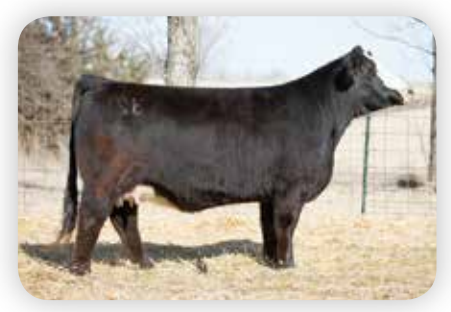
Rubys Magnetic Lady 328A - Dam of Lot 69