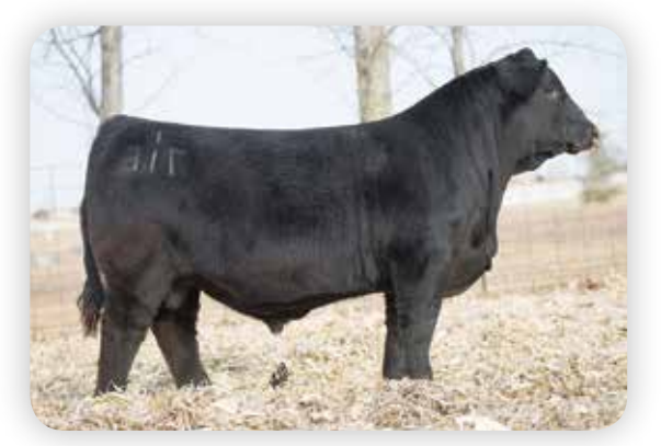
Rubys Turnpike 771E - Full Brother to Lots 15 - 20