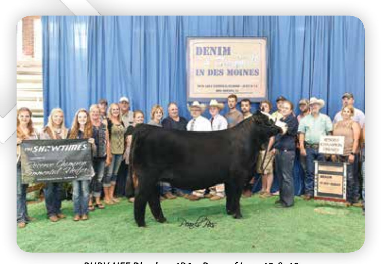
RUBY NFF Rhythm 4B1 - Dam of Lots 48 & 49

You won't find any cooler looking purebred bulls around