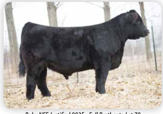
Ruby NFF Justified 883F - Full Brother to Lot 70