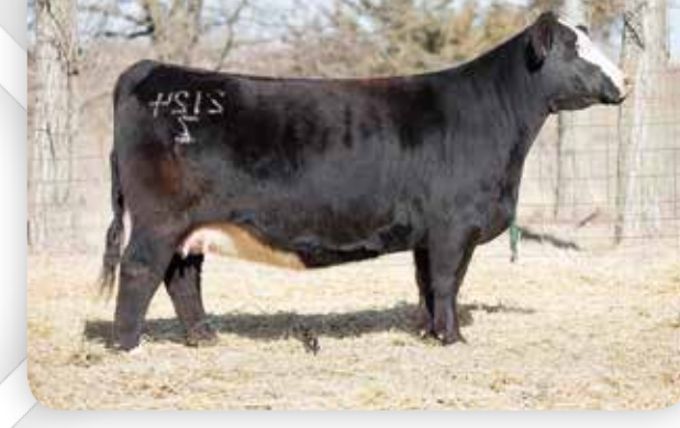
Ruby NFF Rhythm 2124Z - Dam of Lot 11

Currency is the $435,000 stud from the 2017 calf crop. We did not get many calves this first year, but the ones we have, we really, really like, and have used him heavy moving forward. They come small, are fast growing, and are elite looking cattle, that are great on their feet and legs. This son and his two brothers on the next page are peas in a pod. They are as good looking purebred Simmental bulls as you will find. They are big bodied, stout made, and we love their structure. They are backed by a couple of our most proven donors. The 9171G bull is a full brother to the heifer that just topped our female sale at $25,000 to Shoal Creek Land and Cattle. If you want to add eye appeal to your herd, these guys will do it in a generation.