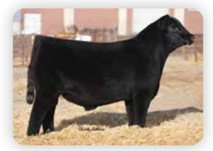
Silveiras Style 9303 - Sire of Lots 64 - 66

Looking to make some females? Start right here. These Style sons are all grandsons of the great 418P, a cow that will forever leave her mark on our operation. These 3 bulls are cool looking, deep sided, smooth made, and sound as cats. They are stouter than your average Style sired progeny as well. They have all had full sisters that are high quality and the 8F6 bulls full sister won the percentage show at the Western Regional. All indicators point to the national cowherd looking to expand in a couple of years with all the heifers that have went to town. These bulls are the kind that can produce those bred heifers that will command a premium. Take a good look at these maternal giants.