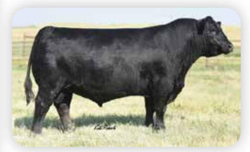
CCR Pay Dirt 2340C - Sire of Lots 62 & 63