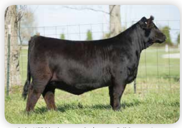
Ruby NFF Rhythm 9172G - $25,000 Full Sister to Lot 11