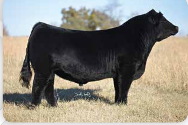
LLSF Pays To Believe ZU194 - Sire of Lots 70 - 73

Here is a pull brother to the high seller from last years bull sale.