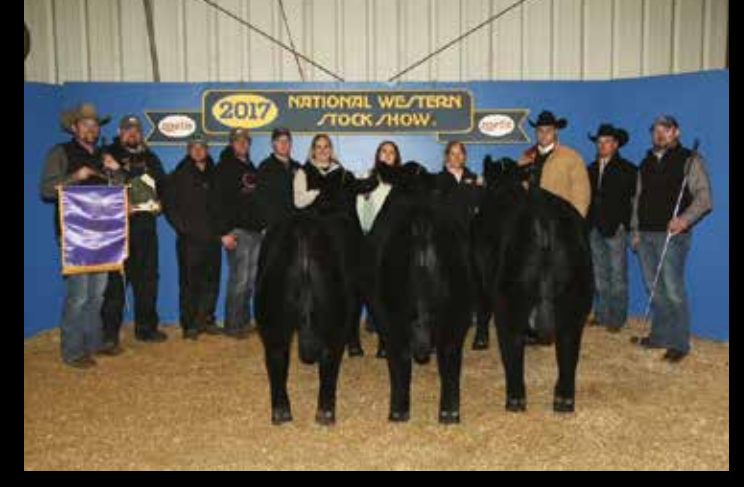
Champion Pen of 5 Simmental Bulls