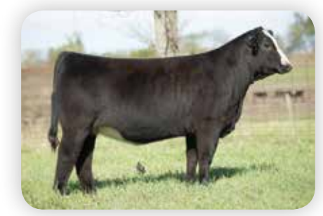
Ruby NFF Rhythm G144 - Full Sister to Lots 65 & 66