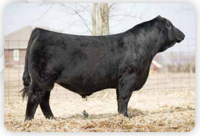
Oval F Echo E709 - Sire of Lots 21 - 33