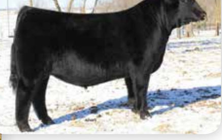
Ruby's Currency 7134E Sire of Lots 11 - 13