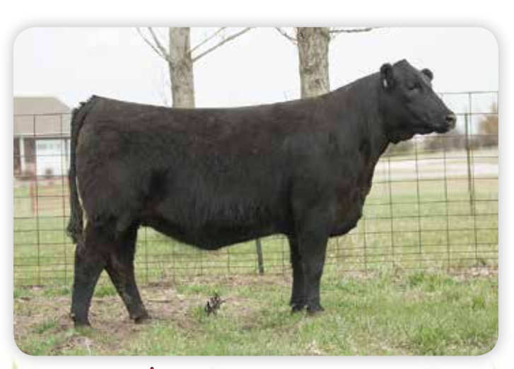
Let 33 RUBYS JUANADA 9684