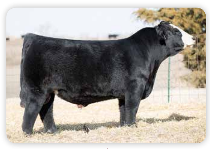
RUBY/SWC GENTLEMAN `S JACK - Sire of Lots 1-4

Balance and complete describe this one really well. Its really hard to poke a hole in this one. Soft, smooth, sound, and good looking. She will hunt!