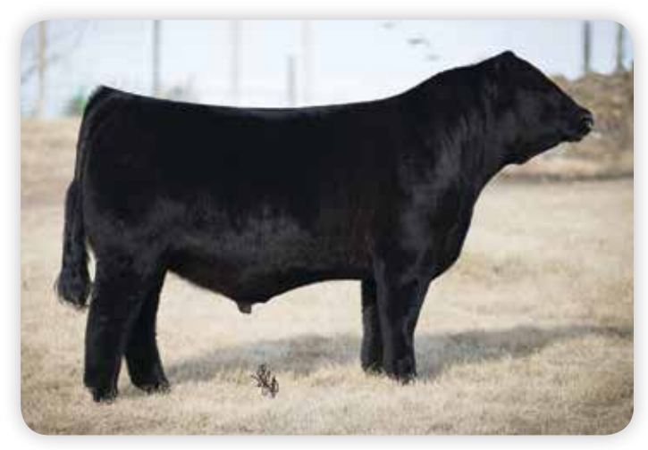
RUBY SWC BATTLE CRY 431B - Sire of Lot 42 & 43

If your hunting that cow changer late in the game, here he is! You can't make a purebred any better looking than this one and throw a blaze face on him to boot. We like this one a great deal.