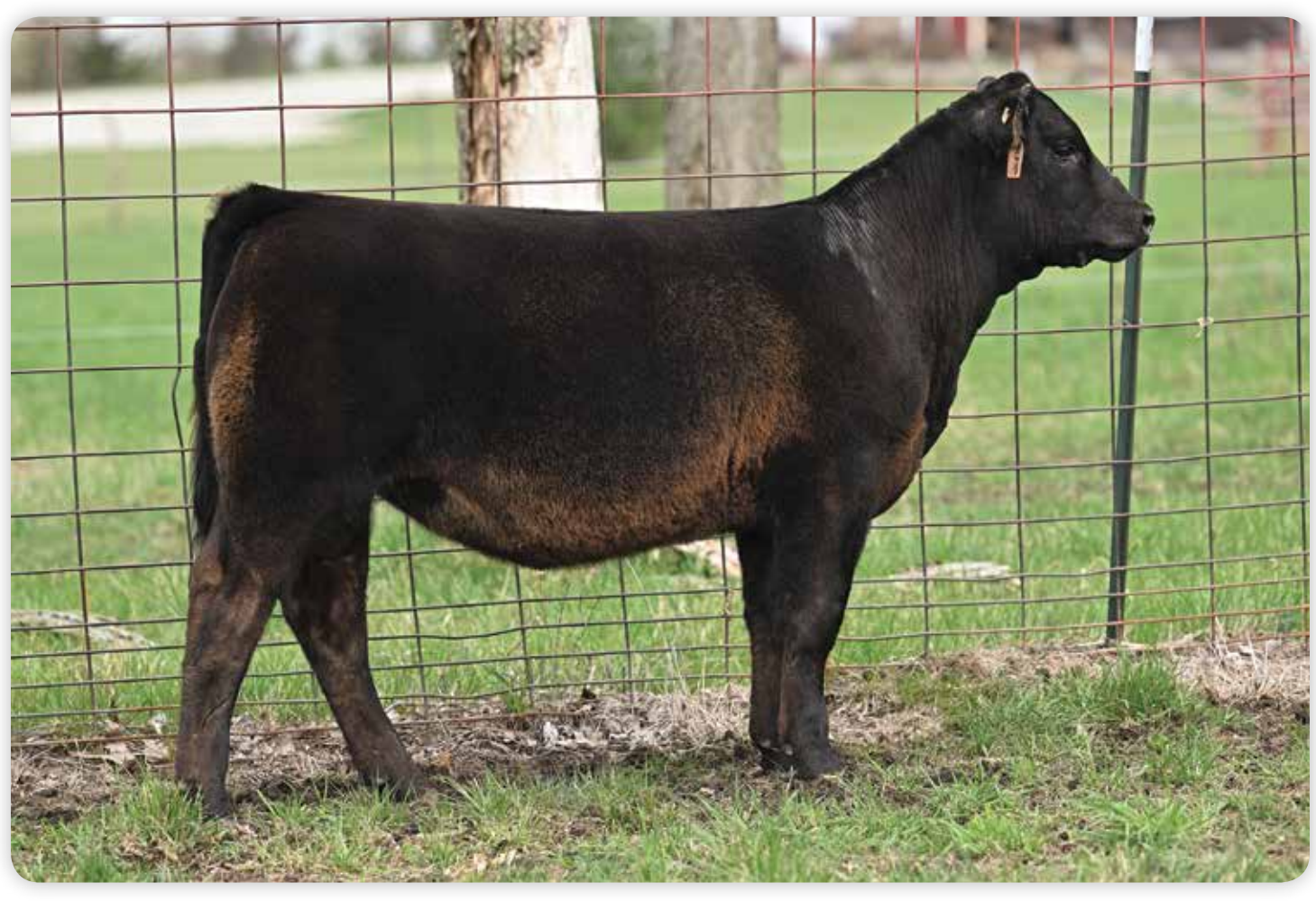
Lef 17 RUBYS LIBERTY OH13