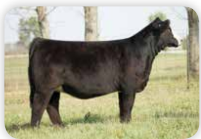
RUBY NFF RHYTHM 060H Full Sister to Lots 1-4

If you're looking for the ultimate wow factor, this one has it in spades. Cobra necked with great presence, this one has the shag and the power that will transform her next generation.