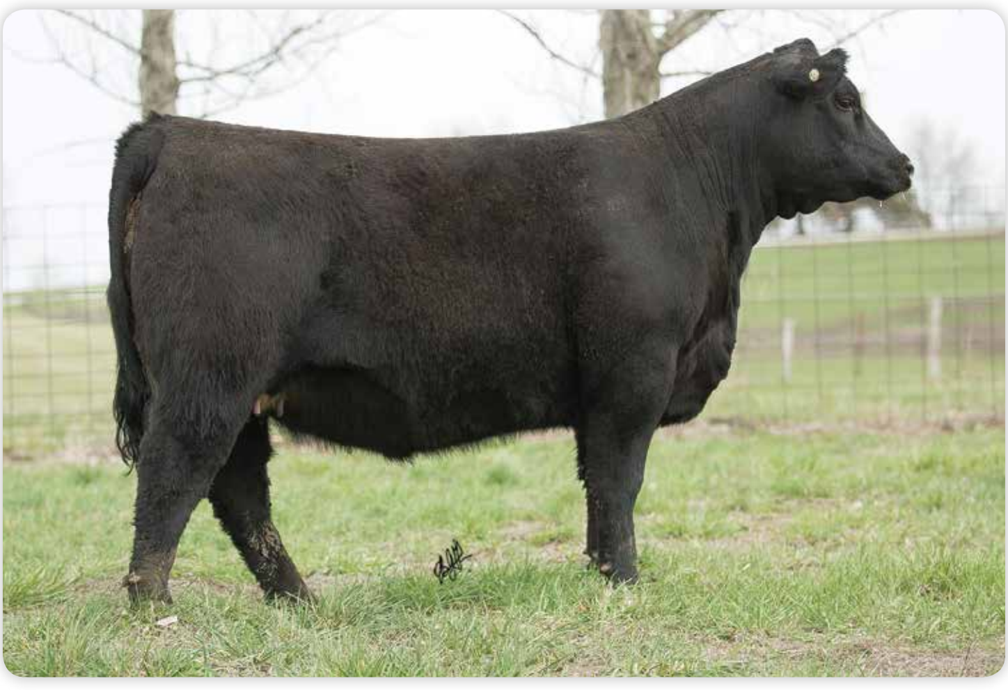
Let 20 RUBYS JUANADA 9G56

Unfortunately, we lost the Cash Flow bull this winter. We just calved his first daughers and are most impressed. They are good looking females that calve by themselves, great udders and still bring a great set of EPDs to the table. You will notice in this offering we are offering some spring born females. We had some really bad luck with some semen last spring, and by the time we figured out what was going on, our clean-up bull had way to much work to do. Don't hold that against these girls, it sure wasn't their fault.