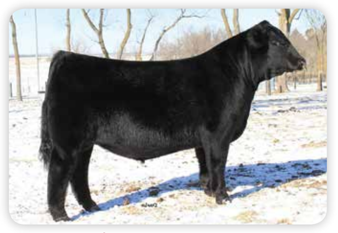
RUBY S CURRENCY 7134E - Sire of Lot 5

Whoa! This one has got the goods. Great looking, sound as a cat, stout made and good bodied. She puts it all together and she knows it! A full sister to the high selling open in our 2019 Fall sale to Shoal Creek, and a high selling bull selling to Shoal Creek and Purdue Beef unit. This mating has been rock solid and this is one of the best ones yet. Here is another one that can put you on the map.