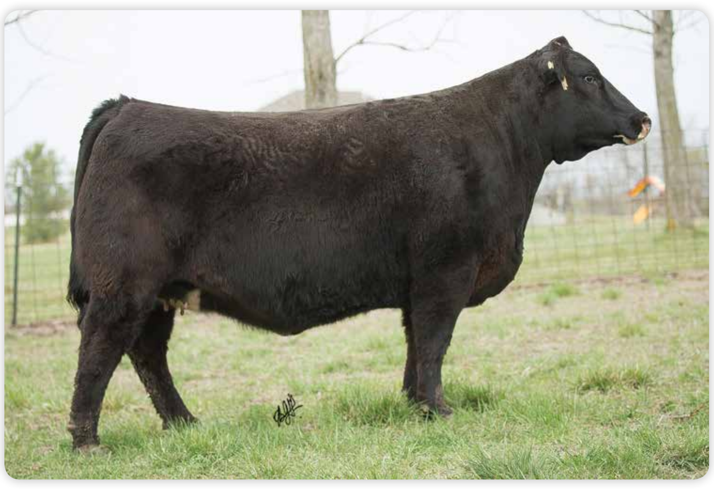
Let 28 RUBYS RHYTHM 920G

We really like the CEO daughters. They are good footed, athletic built females with extra look and extension. They have great pieces to build around to make the next generation even better. The CEO daughters we are offering here come from some of our most productive cow families. Take them home and put them to work, you will be glad you did.