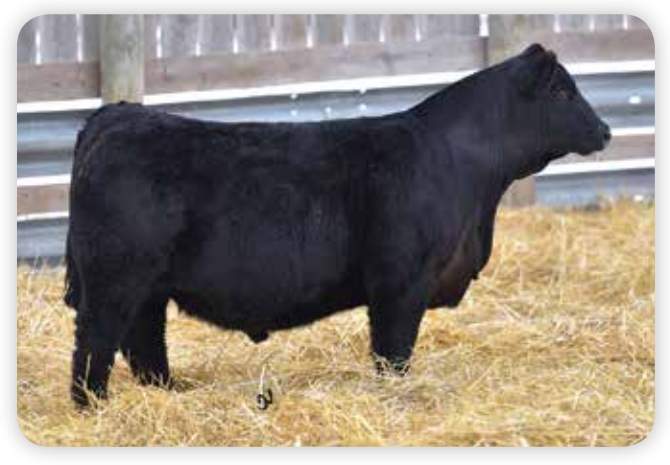
CDI CEO 281D - Sire of Lots 28-33

LIVIN' THE DREAM - SPRING EDITION VOL II