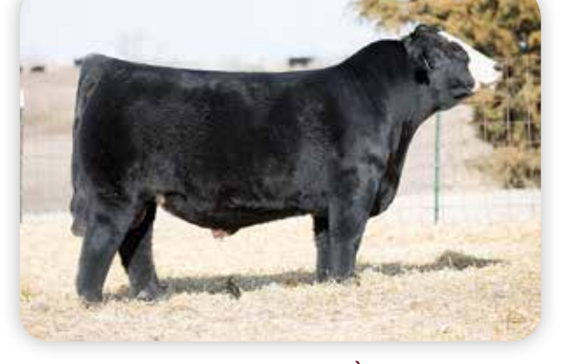
RUBY/SWC GENTLEMAN`S JACK Maternal Brother to Lots 10 & 11