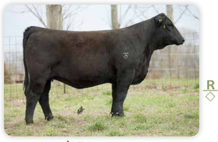
et 40 RUBYS RITA G958