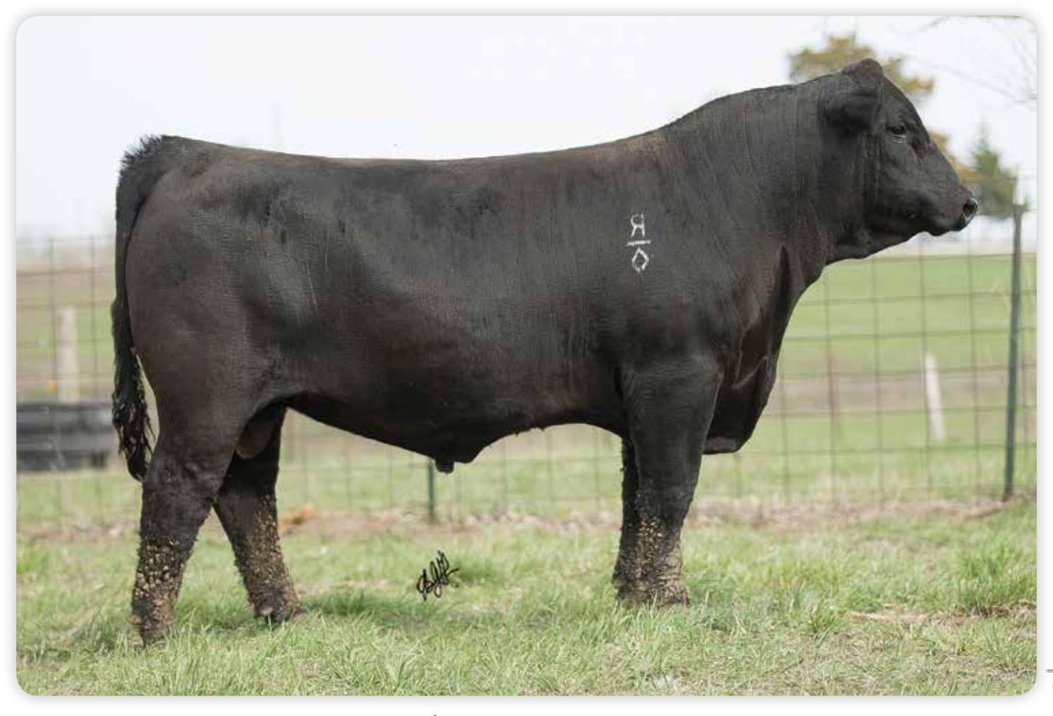
Let 49 RUBYS ECHO 0146H