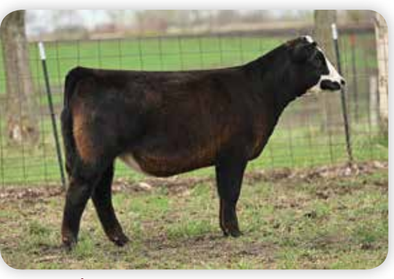
🛃 🤔 RUBYS ROSETTA HOO54