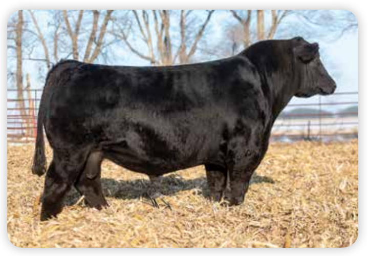
W/C DOUBLE DOWN 5014E - Sire of Lot 44

You cant hardly make them any better looking than this guy! He is still soft made, powerful, and super sound. One of Hook's favorites on picture day. Backed by a great cow family as well.