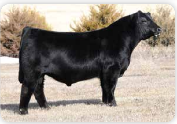
W/C RELENTLESS 32C - Sire of Lot 10