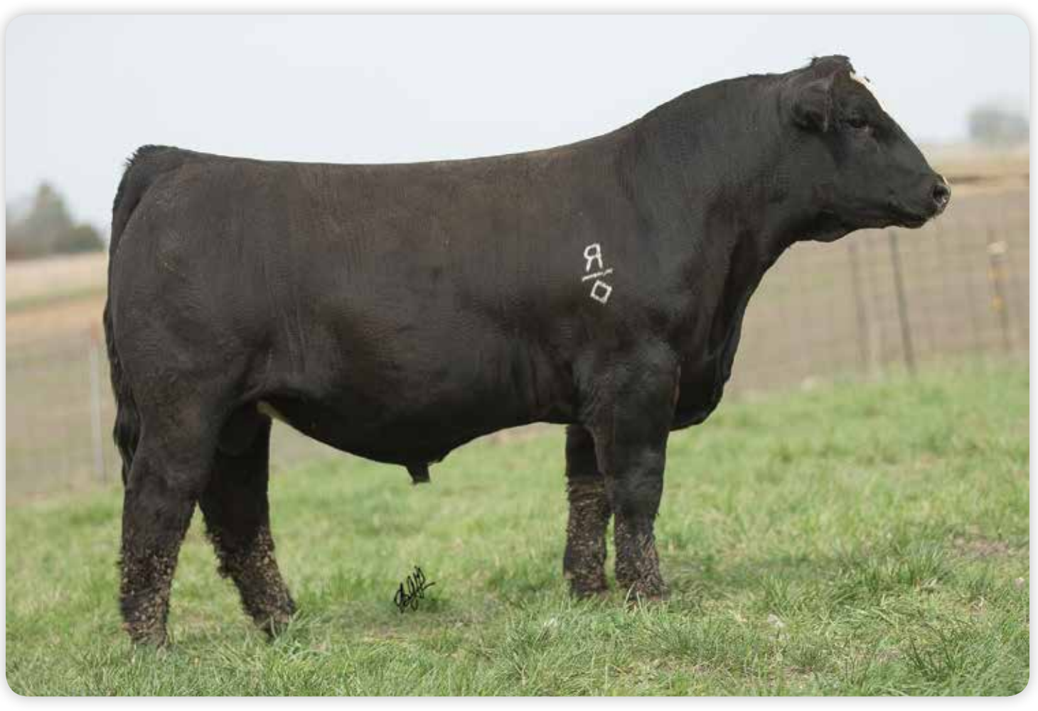
Let 42 RUBY NFF BATTLE CRY 065H