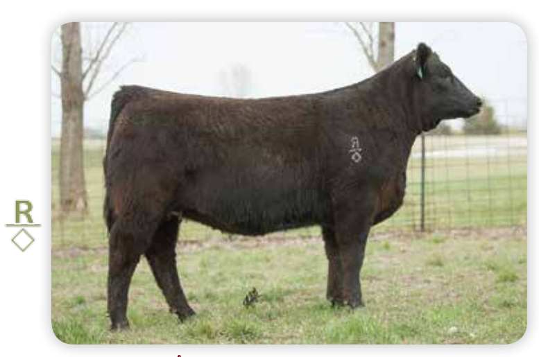
Let 32 RUBY MS TRAVELER 9G86

9.45 1.85 75.1 119.1 2.9 19.9 0.28 12.0 57.4 14.4 29.0 -0.28 0.13 -0.04 0.79 115.7 70.7