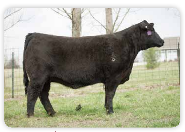
Lef 31 RUBYS ROSETTA G9051