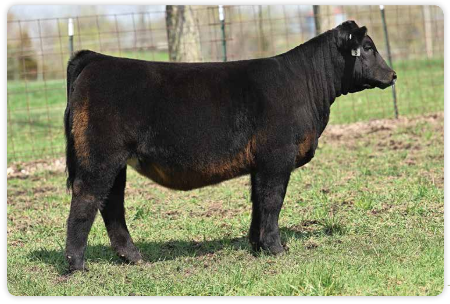
₽ 5 RUBY NFF RHYTHM 0H32