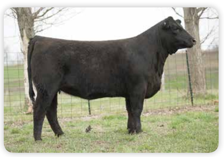
Let 25 RUBYS KAYE 9G12