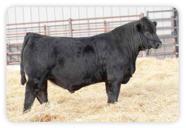
CLRS GUARDIAN 317G - $85,000 high selling service sire to several females throughout the offering

LIVIN' THE DREAM - SPRING EDITION VOL II