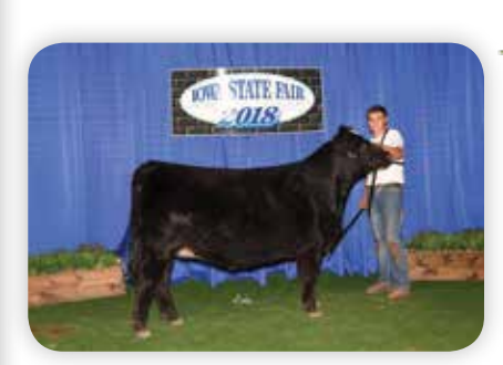
RUBY NFF RHYTHM 715E Dam of Lots 8 & 9