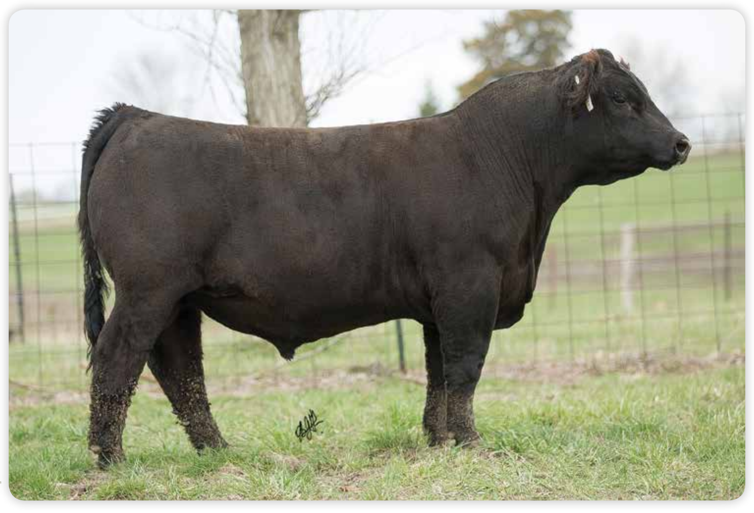
let 44 RUBYS DOUBLE DOWN 0137H