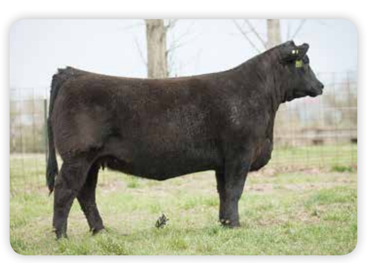
for 26 RUBYS ELINE G947

CE BW WW YW MCE Milk ADG Doc MWW Stay CW YG Marb BF REA API TI 16.5 -1.45 82.5 130.7 10.6 25.3 0.3 13.5 66.5 20.6 35.8 -0.4 0.52 -0.06 1.12 179.4 95.7