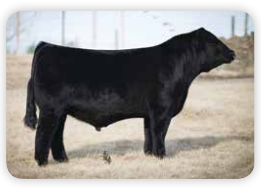
BATTLE CRY Maternal Brother to Lot 34