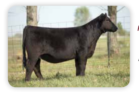
RUBY'S ROSETTA 0118H Full Sister to 12-14 and Maternal Sister to Lot 15

This Jack x Rosetta has been another flush that has flat out worked. The high selling female in last falls sale was a full sister to this mating and the 2 other flushmates were extremely nice as well. These 3 sisters are sure cut out of the same mold, they just come with different color configurations. They are great structured, first and foremost, and combine that with extra eye appeal, softness, angularity and maybe the most important ingredient of all is their dam. The 324A cow just works, she makes the good ones time after time that are sought after for show heifers and breeding pieces. You get to pick and choose, but they all sell, make sure one gets in your barn!