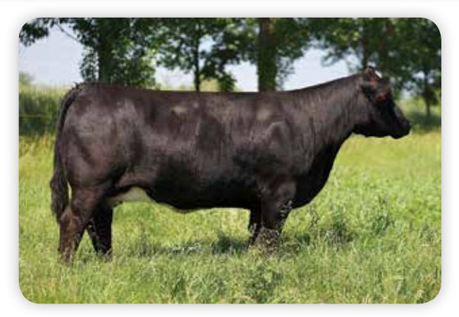
RHYTHM 418P - Legendary Maternal Granddam of Countless Females throughout the offering!

What a way to kick off this years offering! 4 full sisters stemming from one of the most predictable matings to date here in Murray. All 4 females offer some differences that will allow you to find your favorite, but the eye appeal and wow factor that these girls bring to the table is second to none. The lot 1 female combines that killer look with the softness, soundness, muscle shape that we are all after. She is great haired and will make a great senior yearling. If your serious about the business, step in here!