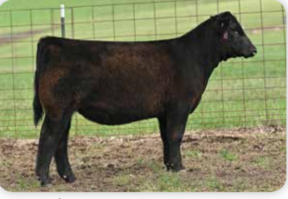
et 12 RUBYS ROSETTA HOO51