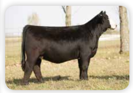
RUBY'S RHYTHM 048H Full Sister to Lot 8 & Maternal Sister to Lot 9