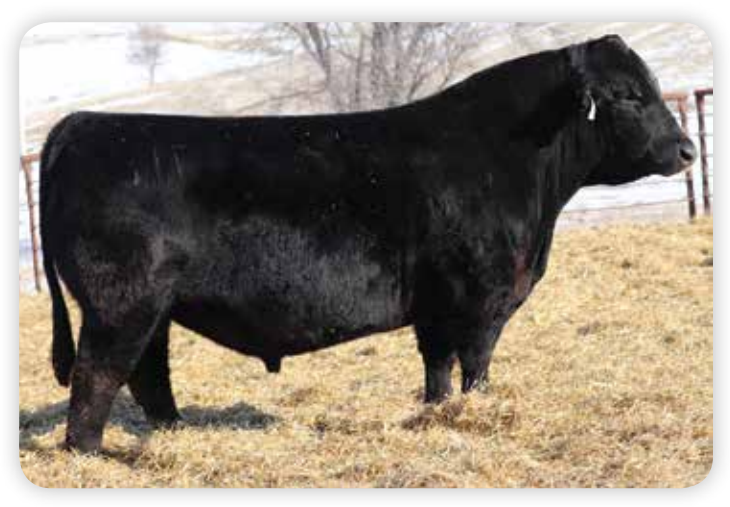
RUBYS TURNPIKE 771E - Sire of Lot 17

Study this ones pedigree, and you will notice that this eye catcher goes back to the famed S600 female made famous at Foster Brothers that now resides at Hotz Farms. Here is a younger female, but she is very good in her lines and the parts and pieces are all here to make a really awesome Senior Yearling. This one's dam did a bunch of winning a couple summers back. She was a bit later maturing as well, but when she hit her stride, she made her presence known. Don't miss this one.