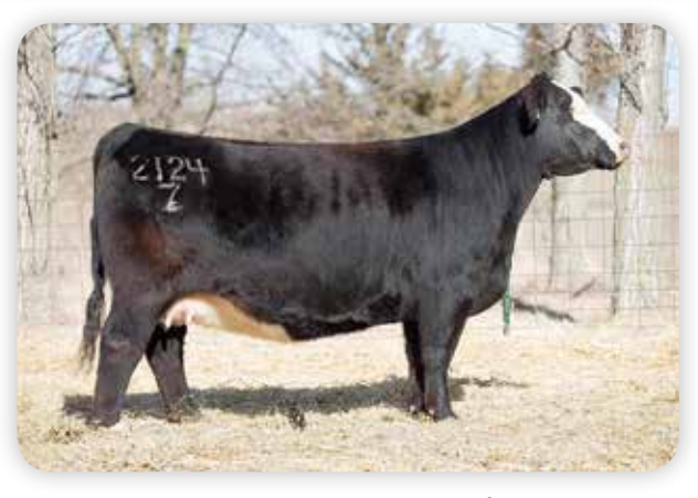
RUBY NFF RHYTHM 2124Z - Dam of Lots 1-7