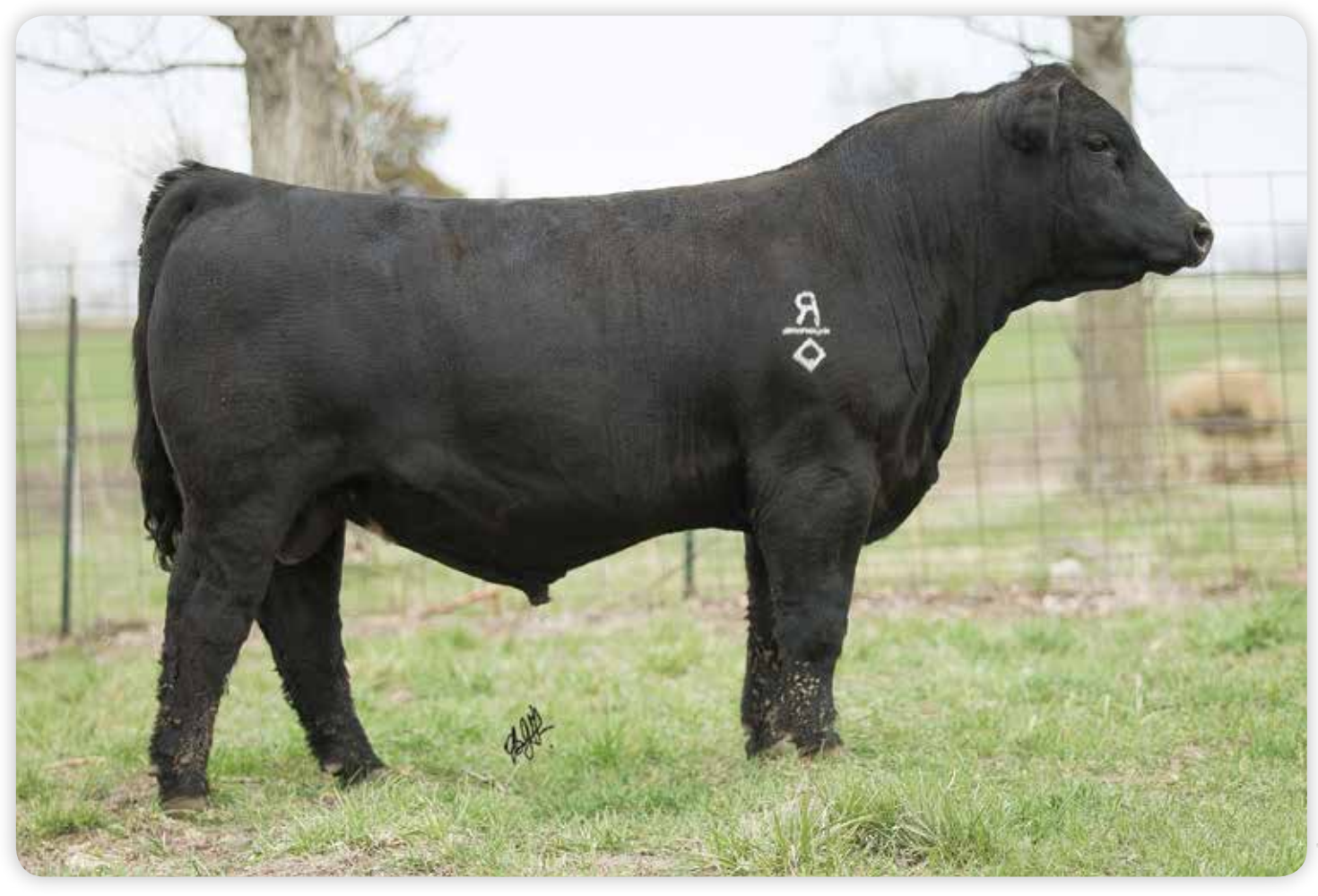
et 43 RUBYS BATTLE CRY 099H