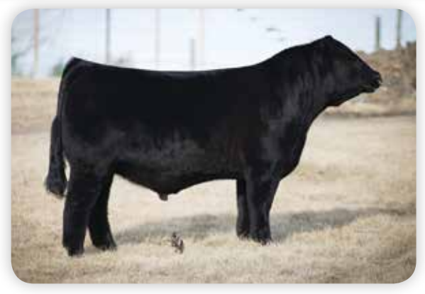
RUBY SWC BATTLE CRY 431B Maternal Brother to Lots 10 & 11