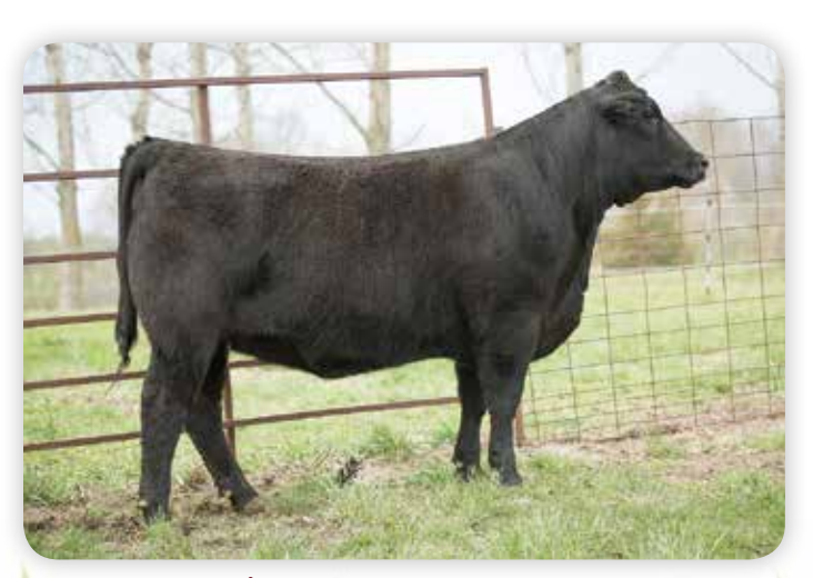
Let 27 RUBYS ROSETTA G935