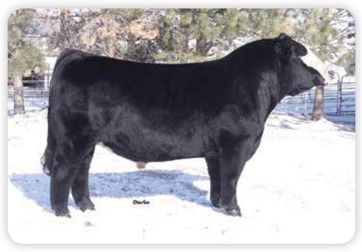
MR HOC BROKER - Paternal Grandsire of Lot 43

This one is what you would expect when you look at his pedigree. He is a great looking stud that is stout, square, big bodied and moderate in his frame. He will make those highly sought after, fancy replacements.