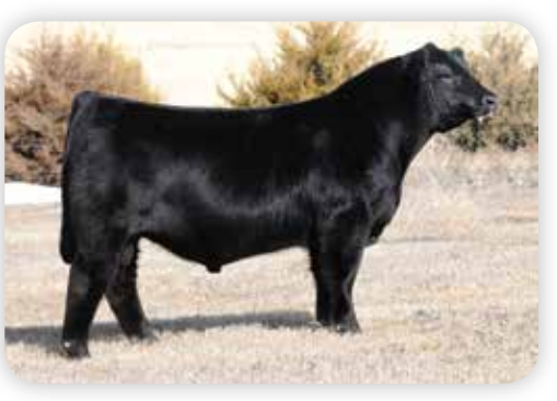
W/C RELENTLESS 32C Sire of Lot 34