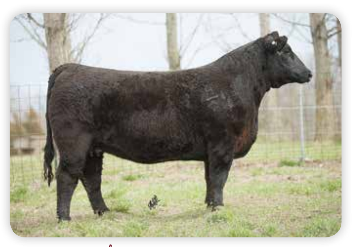
RUBYS LINDA 930G