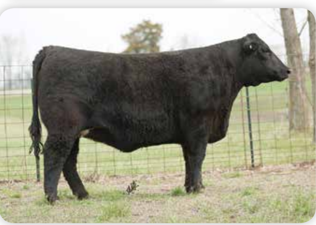
Let 37 RUBYS FOXY LADY 9118G