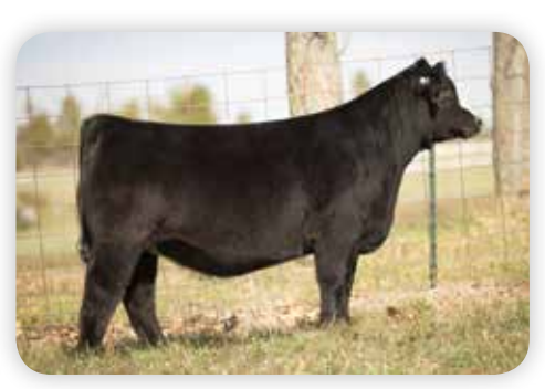
RUBY'S ROSETTA 0134H Full Sister to 12-14 and Maternal Sister to Lot 15