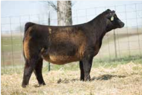
RUBY SWC YETTI 9G36 $20,000 MATERNAL SISTER TO LOT 37