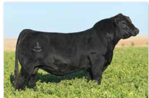
KCC1 EXCLUSIVE 116E - SIRE OF LOT 6