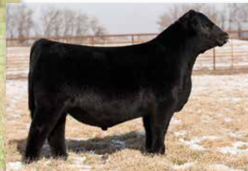
PVF BLACKLIST 7077 - SIRE OF LOT 5