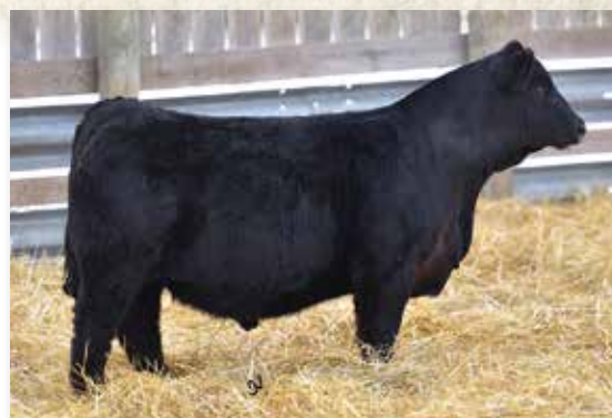
CDI CEO 281D - SIRE OF LOT 63