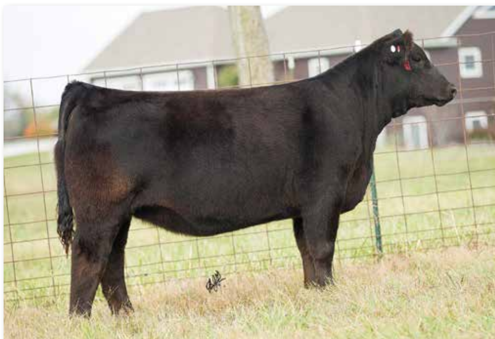
Lot 11 RUBY NFF RHYTHM 1113J

The Y1201 cow is the stoutest made, widest pinned, biggest hipped Style female I have seen anywhere of any breed. She is also one of the best looking and most productive cows on the place and makes an argument for one of 418P's best daughters. We had never flushed this female till now and this pair of daughters is what we were hoping for. They are long fronted, long bodied, stout made, super athletic females that are a bit later in their maturity pattern which is ok in my book. If you like some added frame and performance in your cattle, these girls will be right up your alley.