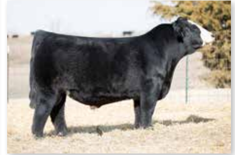
RUBY/SWC GENTLEMAN`S JACK - SIRE OF LOTS 1-4

This blaze faced female is perhaps the biggest footed, biggest legged female in the entire offering. Huge rib cage, stout made, and still has an attractive look. So many possibilities down the road.