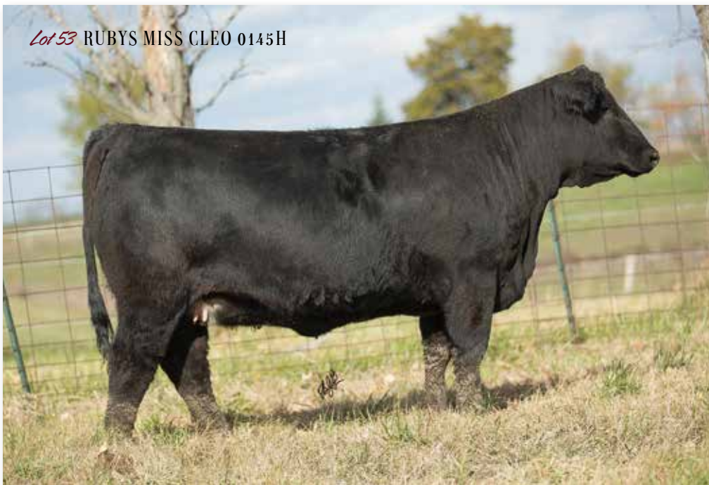
Lot 53 RUBYS MISS CLEO 0145H