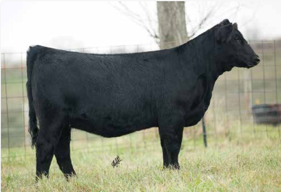
Lot 15 RUBY MS LIBERTY 105J