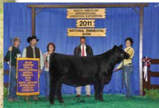
FBFS X-CLAMATION - 2011 NAILE GRAND CHAMPION FULL SISTER TO MATERNAL GRANDAM