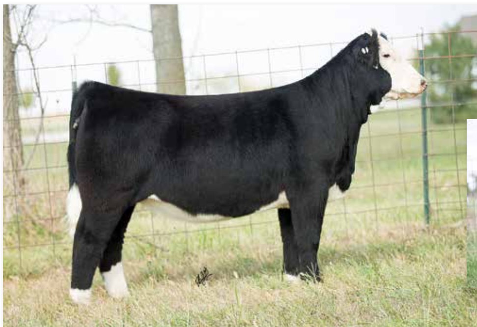
Lot 4 RUBY NFF RHYTHM 138J

A little extra chrome will always get you noticed and hopefully her quality will get noticed too. She is cool looking, correct, and angular as her picture shows. Imagine some SimAngus cattle out of this one!