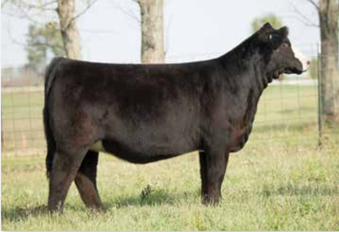
RUBY NFF RHYTHM 060H - FULL SISTER TO LOTS 1-4