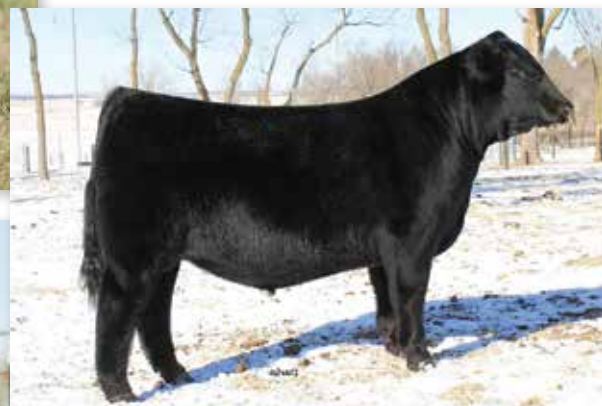
RUBY'S CURRENCY 7134E - SIRE OF LOTS 41 - 47

Lot 41 RUBYS JUANADA 0178H Talk to anyone who calved Currency heifers this spring and they will tell you how much they love them. Here's your chance to add some to your herd, and here is one of my favorite bred we have ever let go. Awesome looking, super sound, great center body, and stout made. The Angus cow she goes back to is one of our best cows as well. I could write a book on this one, just come see her for yourself and you will understand. We couldn't get a sex on her Sriracha calf, but bull or heifer, it will work!