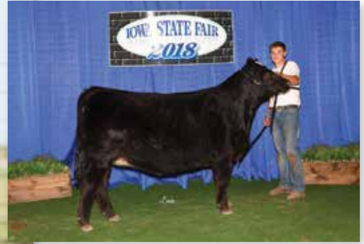
RUBY NFF RHYTHM 715E - DAM OF LOTS 7-9

I sure like this pair of sisters. Other than one being a baldy, and one solid black, they are about twins. These sisters are good looking, big bodied with big feet and legs and nice haired. If you like your females with a little extra dimension, these are a couple to check out. Big time breeding value here for sure.