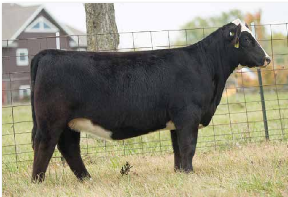
Lot 13 RUBY YOKO 116J

What a unique pair of sisters here. I wouldn't go as far as using the word exotic to describe them, but they are close. Long necked, stout made, big bodied, big legged and good haired. You can breed these things for breeding cattle or you could breed them to make steers, that choice will be yours. All I know is, if you have something that is different, yet still has quality, they have value. These ladies will add value to their offspring, that I am certain.