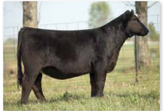
RUBYS ROSETTA 0118H HIGH SELLING MATERNAL SISTER TO LOT 21