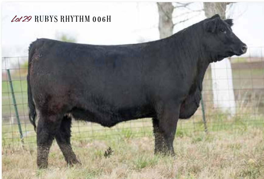
Lot 29 RUBYS RHYTHM 006H