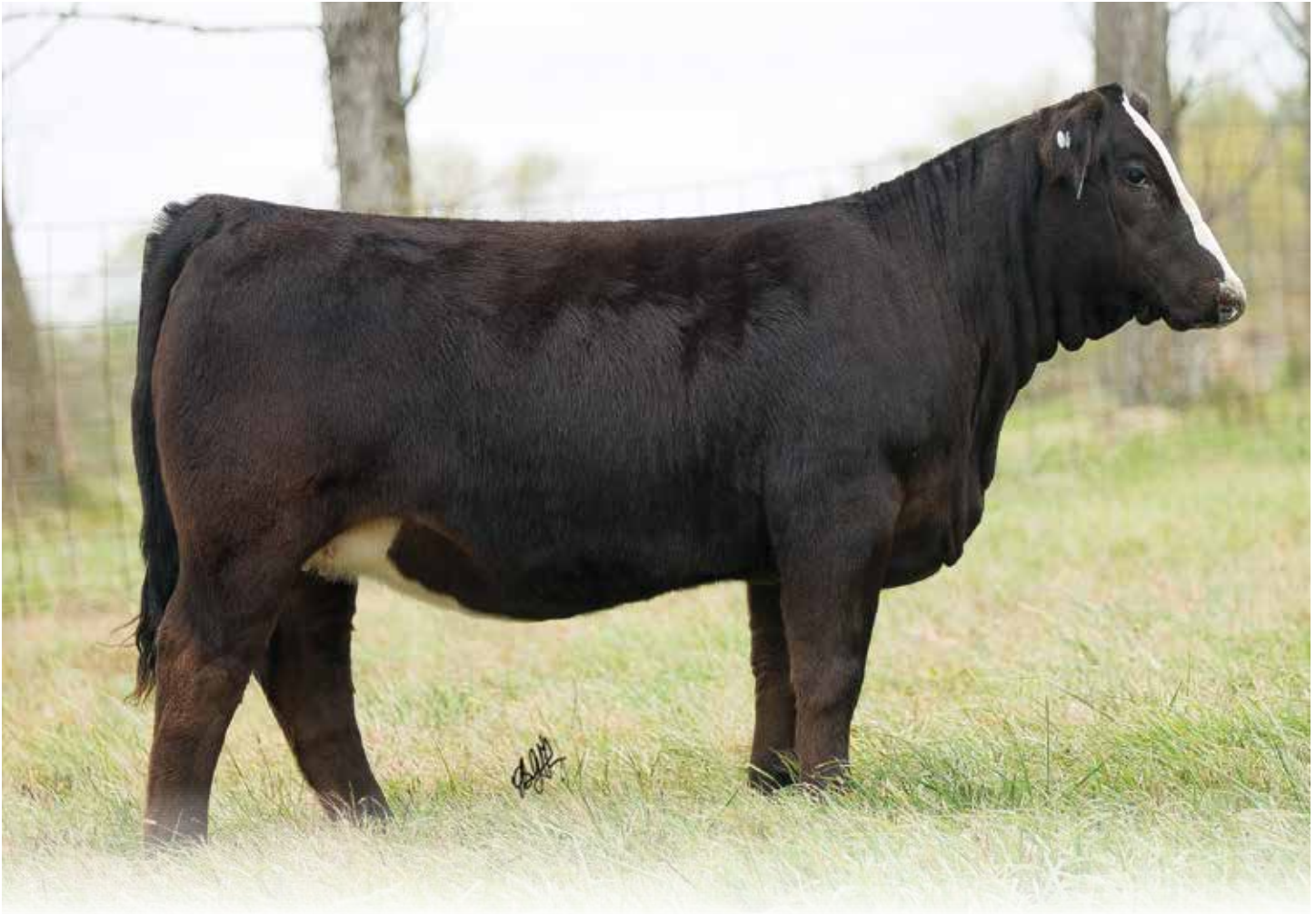
Lot 9 RUBYS RHYTHM 189J