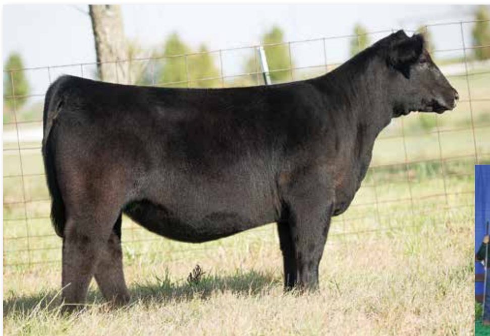
Lot 12 RUBY YOKO 110J