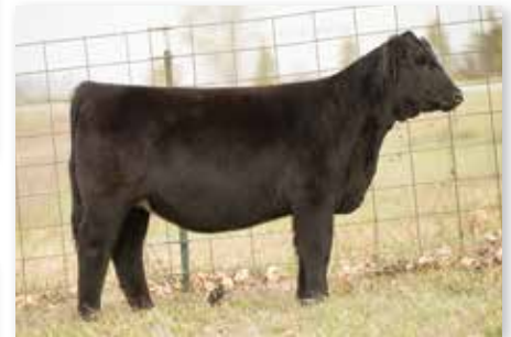
RUBY NFF RHYTHM 058H - FULL SISTER TO LOTS 1 - 4