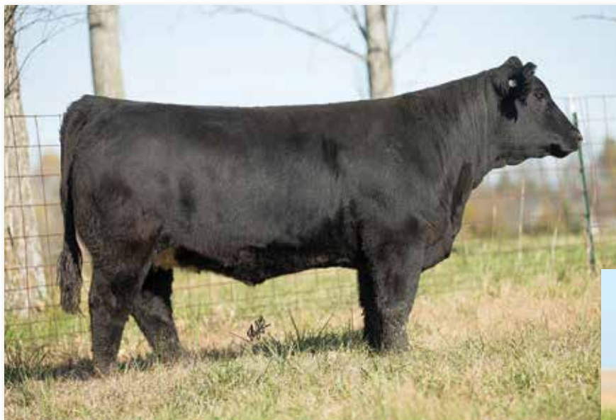
Lot 33 RUBY NFF RHYTHM H064