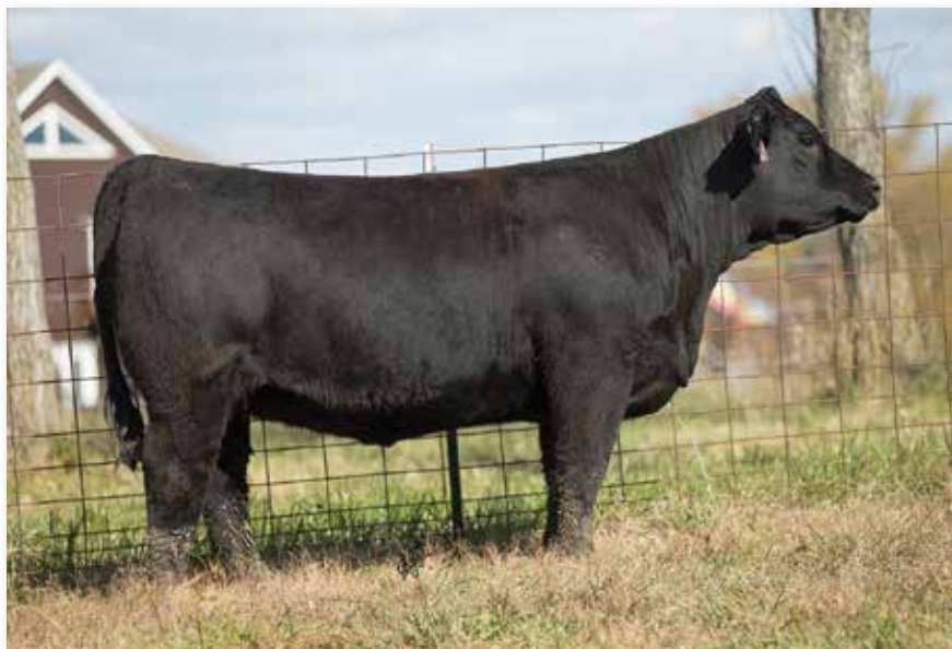
Lot 32 RUBY NFF RHYTHM H059