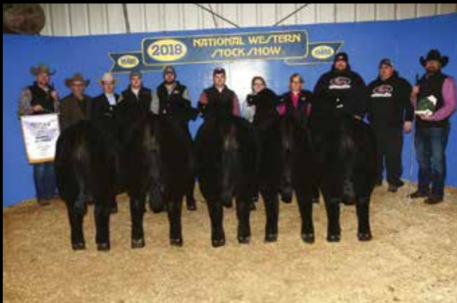
2018 Reserve Grand Champion Pen of Five