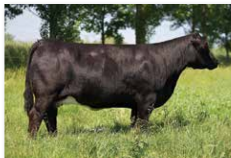
RHYTHM 418P - FOUNDATION DONOR DAM AT RUBY CATTLE COMPANY