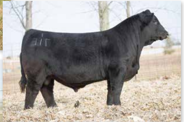
RUBYS TURNPIKE 771E - SIRE OF LOTS 48 - 49

We probably need our head checked here because this is one that shouldn't be leaving. She makes an awfully strong argument for the best bred we have ever offered for sale. She is as complete as they come, backed by an incredible Hoover dam cow, and come to you with individual ratios of the following: BW 98, WW 109, YW 104, IMF 100, REA 138. Check our her planned mating EPDs, the only figures that are out of the top 25% of the breed are BF and SHR, with API and TI being in the top 3%. You love her performance, you love her on paper, and bet your behind you will love her in person. Make sure your the one that takes her home.