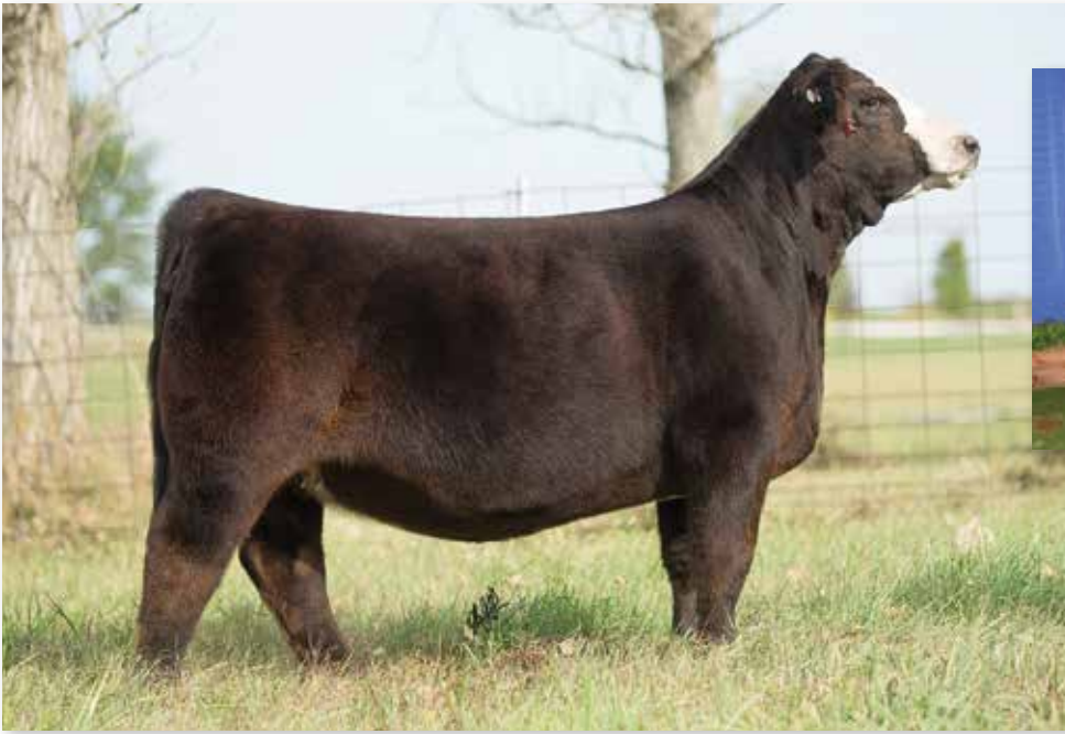
Lot 7 RUBYS RHYTHM 104J