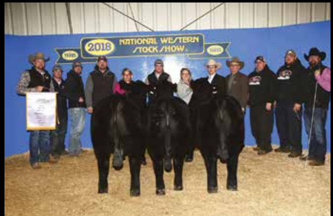
2018 Reserve Grand Champion Pen of Three