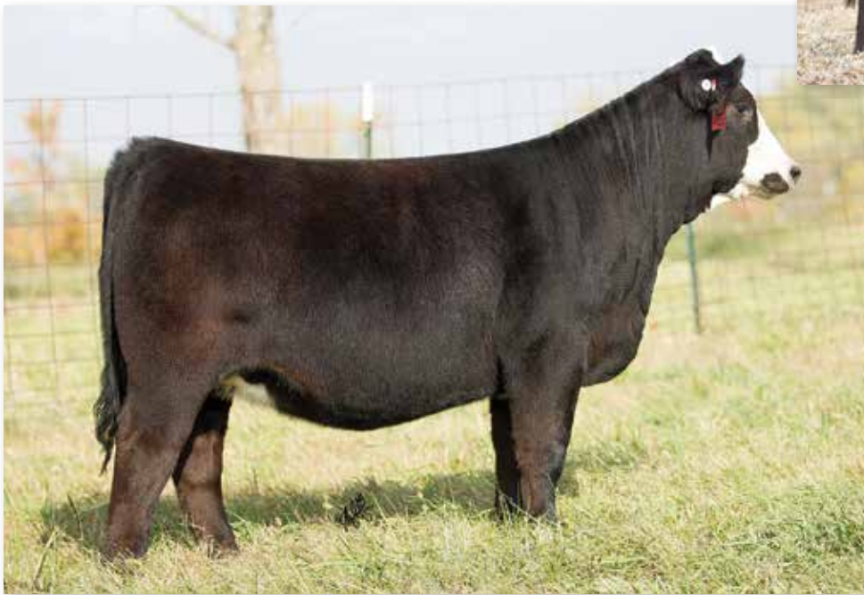
Lot 17 RUBYS JUANADA 1101J

No doubt, one of my favorites here. Too many things to like about this one if that's possible. First off, she's a goggle eyed baldy, awesome. Next, she's good looking, big bodied, stout, square, big footed, and sound as a cat, awesome. Lastly, her grandmother is THE BEST ANGUS COW ON THE PLACE, awesome! This one checks all the boxes for me if you can't tell. I can talk all day about her, but make sure she ends up in your barn on Black Friday.