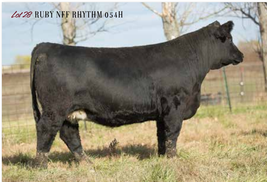
Lot 28 RUBY NFF RHYTHM 054H

Everyone loves a baldy, especially when they're extra good like this one. A full sister to this ones dam commanded $28,000 at a past Livin the Dream sale so you know consistency is bred in. Take a peak at her pedigree, the mating options are truly wide open. Don't miss her!