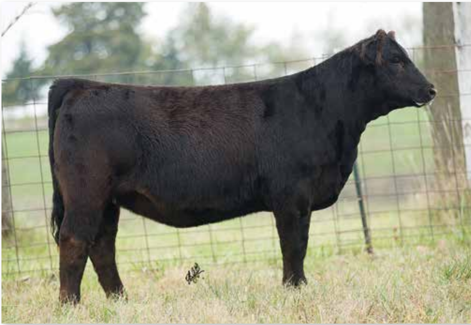
Lot 14 RUBY MS LIBERTY 123J