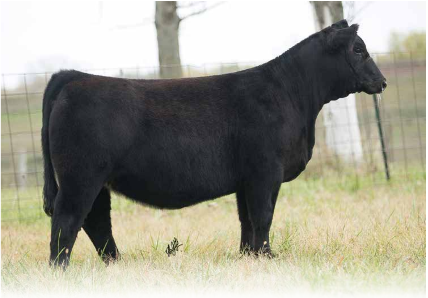
Lot 6 RUBY NFF RHYTHM J279