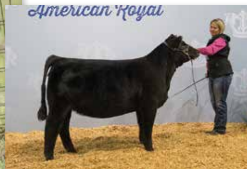
RUBY NFF RHYTHM 702E - RESERVE SENIOR PERCENTAGE CALF 2017 AMERICAN ROYAL AND MATERNAL SISTER TO LOTS 10 AND 11.