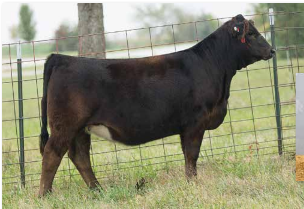
Lot 10 RUBY NFF RHYTHM 185J