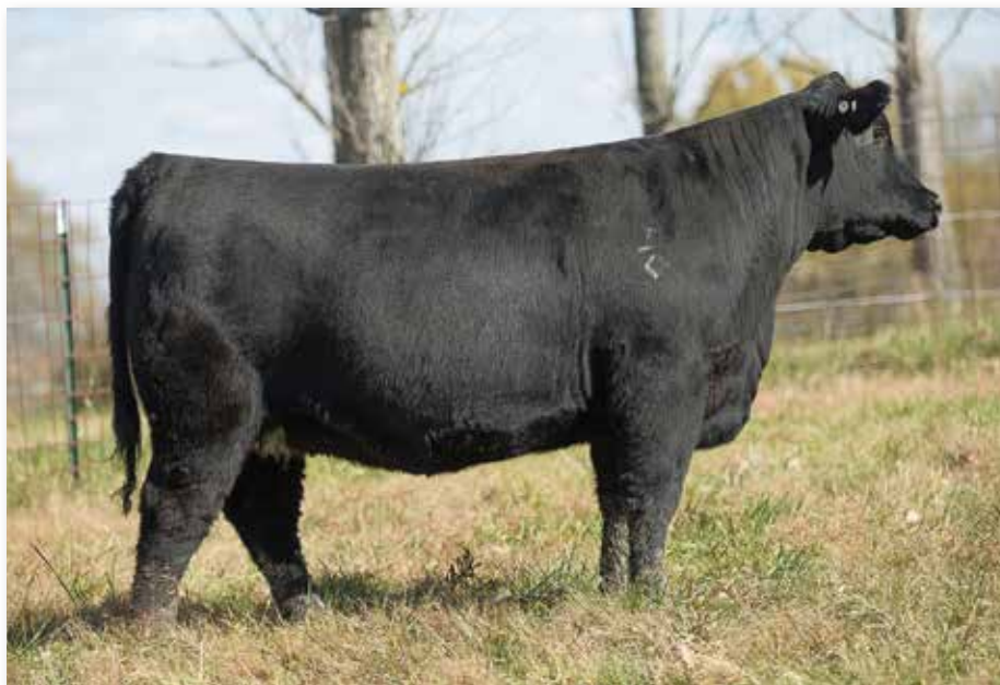
Lot 59 RUBY NFF BLACKBIRD 0201H