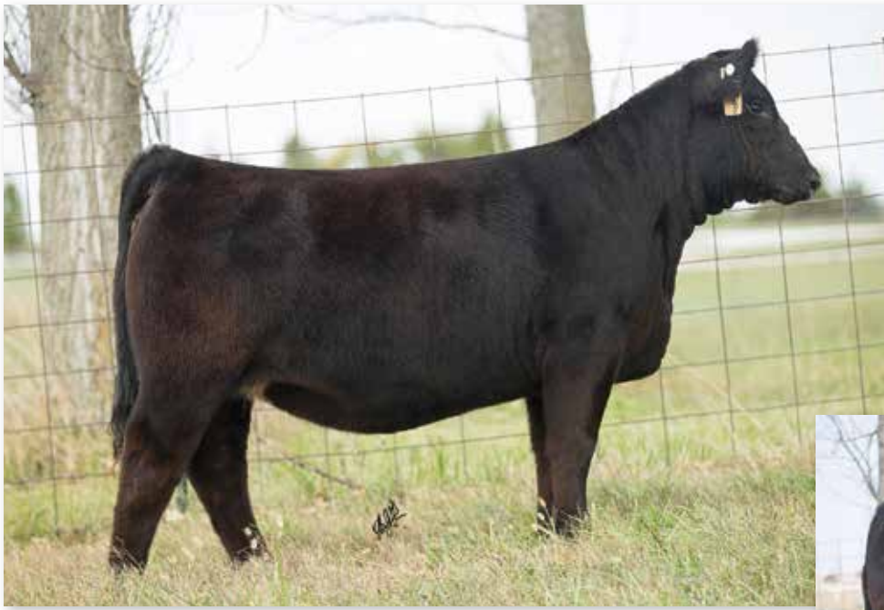
Lot 16 RUBYS ROSETTA 101J