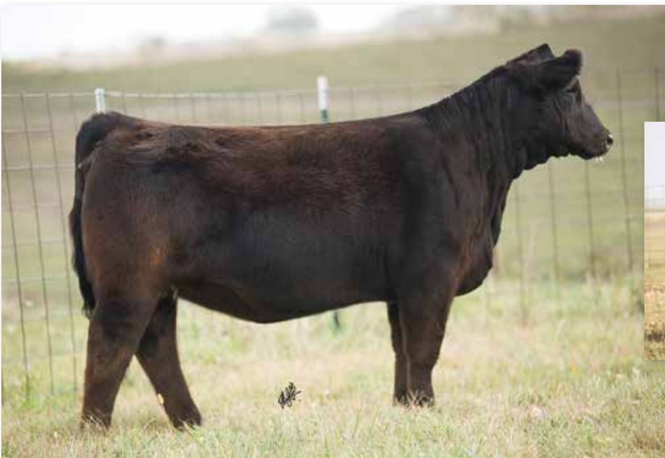
Lot 8 RUBYS RHYTHM 102J

I sure like this pair of sisters. Other than one being a baldy, and one solid black, they are about twins. These sisters are good looking, big bodied with big feet and legs and nice haired. If you like your females with a little extra dimension, these are a couple to check out. Big time breeding value here for sure.