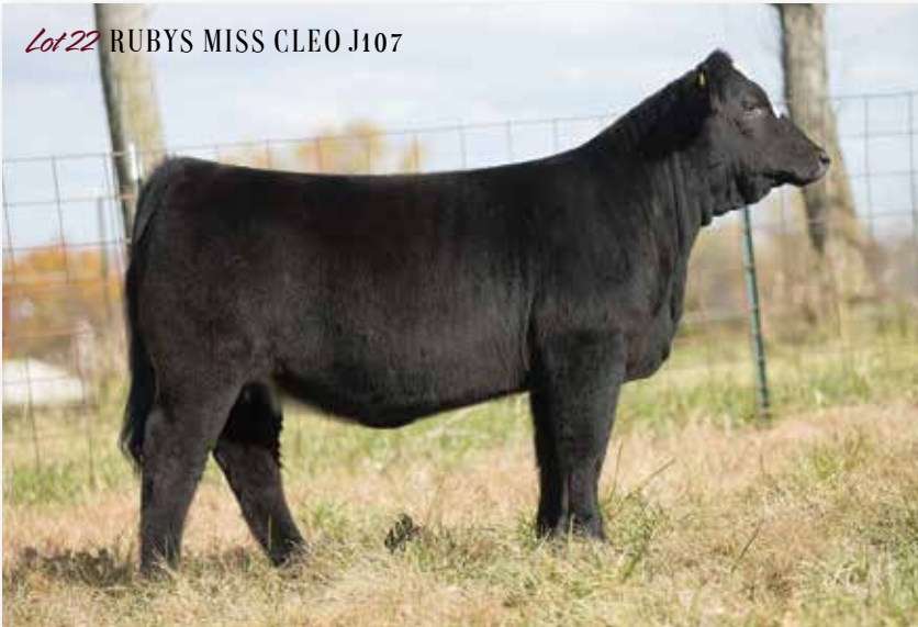
Lot 22 RUBYS MISS CLEO J107