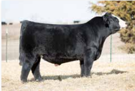
RUBY/SWC GENTLEMAN'S JACK MATERNAL BROTHER TO LOT 37