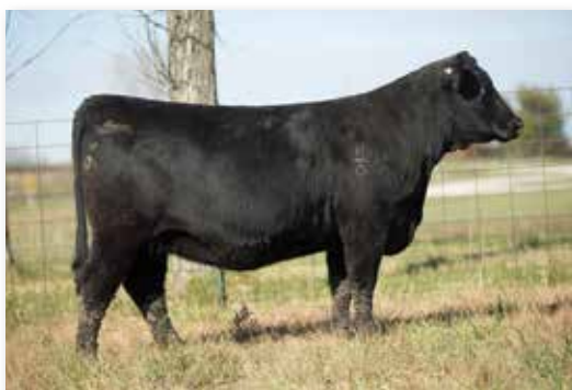
Lot 55 RUBYS JUANADA 093H