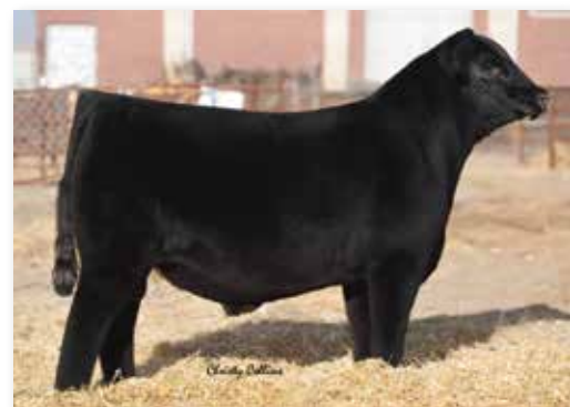
SILVEIRAS STYLE 9303 - SIRE OF LOT 29

Style back on the Rhythms works every time. This female is another shining testament to that. Huge middled and more stoutness than you would expect from a Style sired animal. Her great look coupled with her structure make her a favorite in the pen.