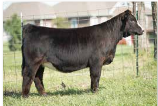
RUBY NFF RHYTHM 9115G

We didn't have many Copacetics, but he worked really well on this cow. This one is stouter than I expected her to be, yet she is still good looking, and soft made. This one has drawn the attention of early visitors as well. Big time cow prospect with a show heifer look.