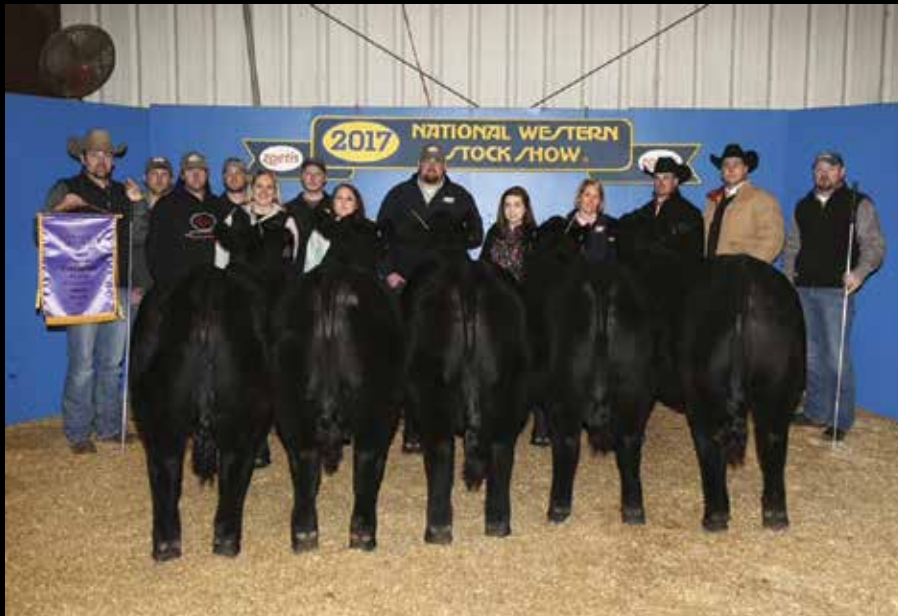
2017 Grand Champion Pen of Five