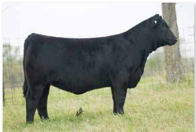
Lot 19 RUBYS FOXXY 1140J