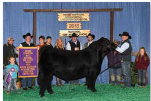
WLE COPACETIC E02 - SIRE OF LOT 9