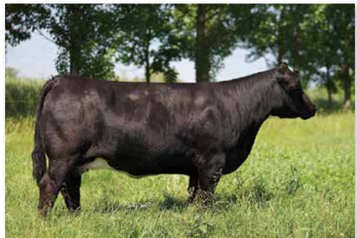
RHYTHM 418P - SIMMENTAL MATRIARCH AND MATERNAL GRANDDAM OF LOT 1