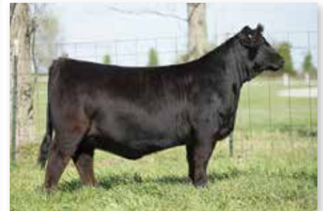
RUBY NFF RHYTHM 9172G - $25,000 MATERNAL SISTER OWNED BY SHOAL CREEK LAND & CATTLE

The solid black one didn't want to cooperate to her full potential on picture day, but we are sure you will like her better in person. As complete as any and maybe as good fronted of any in this mating.