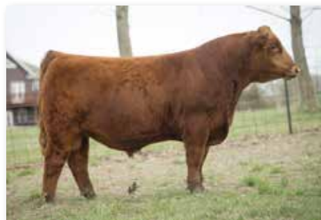
KBHR SRIRACHA H127 - JUNIOR HERD SIRE AT RUBY CATTLE COMPANY AND SERVICE SIRE TO MANY FEMALES IN THE BRED OFFERING!