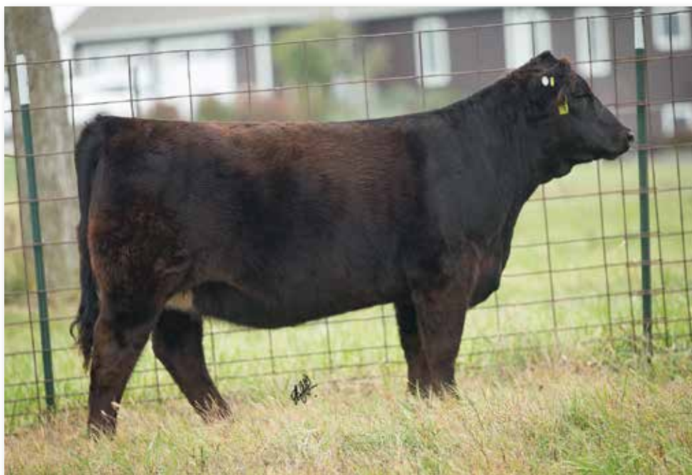
Lot 24 RUBYS LADY 184J