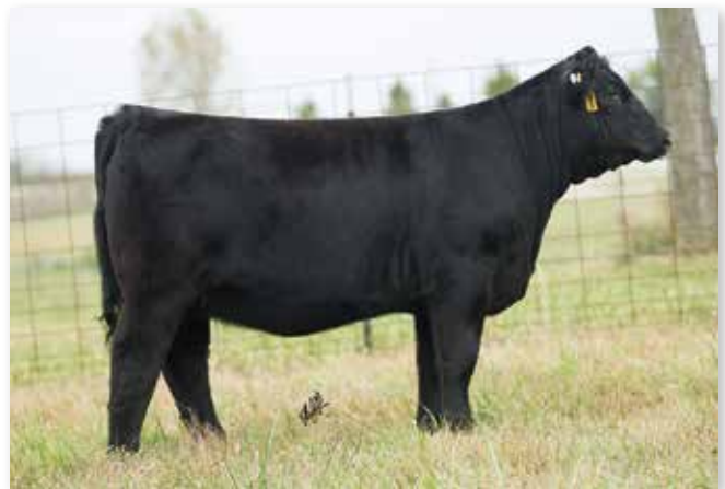
Lot 18 RUBYS JUANADA 1164J

Well balanced, fault free heifer here. I have always took pride in producing good looking cattle from pedigrees that aren't "mainstream" phenotype cattle. This one could probably fall in that category. I look at her pedigree on paper and I really think bull producer, but this one always seems to grab me when she is in a group. Once again, this is the kind we normally keep, but help yourself here, she's got the look, balance, completeness, and disposition to be a really fun junior project.