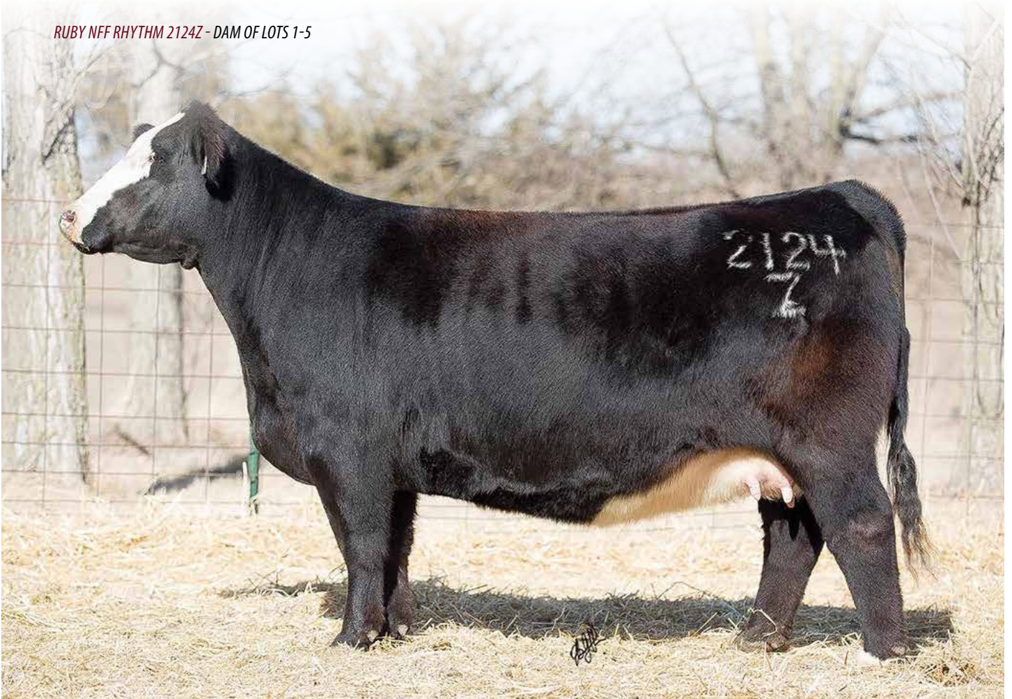
RUBY NFF RHYTHM 2124Z - DAM OF LOTS 1-5