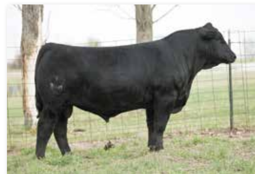
KBHR HOMESTEAD H016 - JUNIOR HERD SIRE AT RUBY CATTLE COMPANY AND SERVICE SIRE TO MANY FEMALES IN THE BRED OFFERING!

Everyone loves a baldy, especially when they're extra good like this one. A full sister to this ones dam commanded $28,000 at a past Livin the Dream sale so you know consistency is bred in. Take a peak at her pedigree, the mating options are truly wide open. Don't miss her!