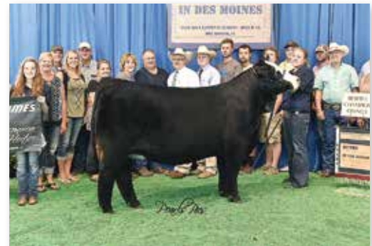
RUBY NFF RHYTHM 4B1 - DAM OF LOT 6

When we sold 4B1 we kept back a couple flushes. We tried the great Exclusive bull on her and it really hit here. This one is really unique. She sets down on a big, perfectly shaped hoof, is super loose in her structure, soft made, smooth and square. She is up headed with great presence and one that really commands your attention. To me, I think her maturity pattern sets her up to be an absolute stunner for the summer shows into the fall. This one shouldn't be leaving.