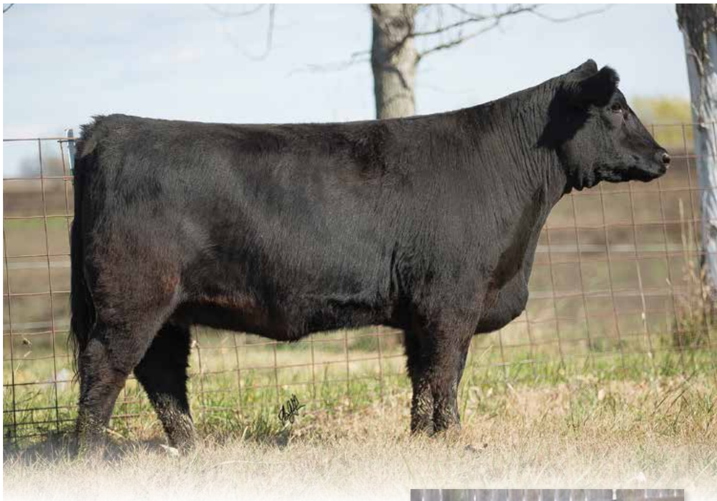
Lot 63 RUBYS ARKDALE PRIDE 9G62