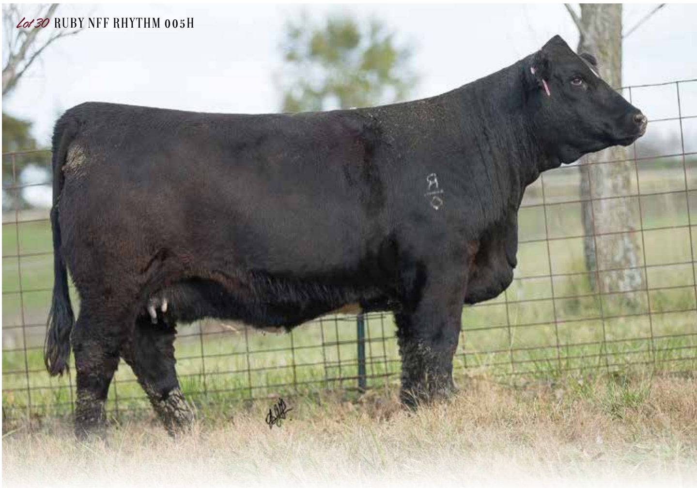
Lot 30 RUBY NFF RHYTHM 005H