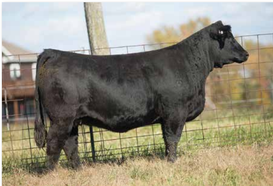
Lot 31 RUBY NFF RHYTHM H056