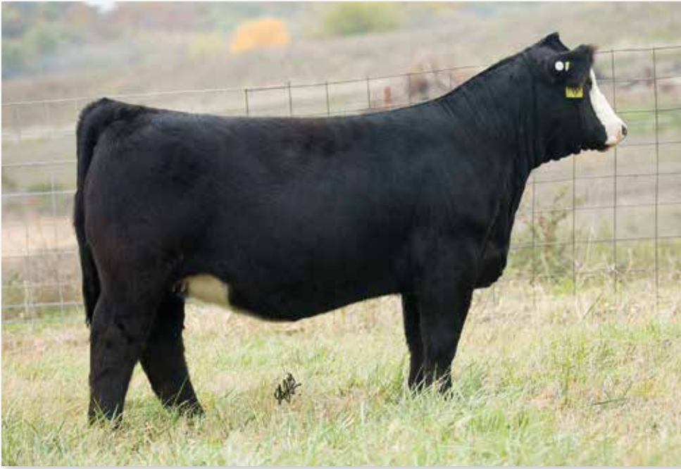
Lot 2 RUBY NFF RHYTHM 117J

This blaze faced female is perhaps the biggest footed, biggest legged female in the entire offering. Huge rib cage, stout made, and still has an attractive look. So many possibilities down the road.