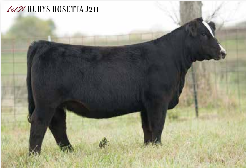
Lot 21 RUBYS ROSETTA J211