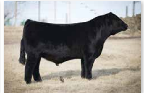
RUBY SWC BATTLE CRY 431B MATERNAL BROTHER TO LOT 37