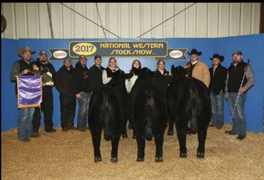
2017 Grand Champion Pen of Three