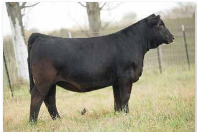
Lot 20 RUBYS KIMBERLY 170J

Just good solid cattle here. Lets face it, not all heifers are going to win Denver, so if you're out to buy a cow first that can double as a show heifer, take a look in here. This one is really complete in here make up and boasts one of the best EPD profiles in the entire offering. Big time growth with top 20% indexes. If you want the most bang for your buck, this one will be a solid investment all week long and twice on Sunday.