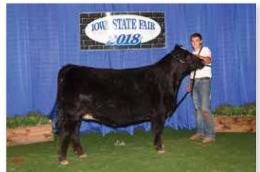
RUBY NFF RHYTHM 715E - DAM OF LOT 27