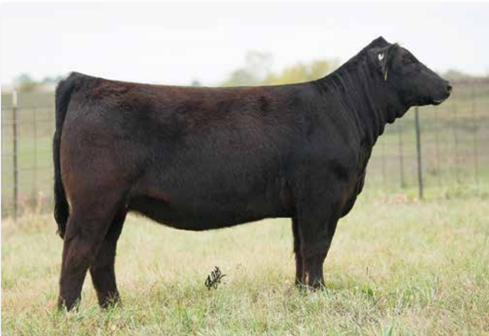
Lot 3 RUBY NFF RHYTHM 119J