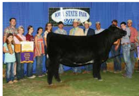
2018 IA STATE FAIR GRAND CHAMPION PERCENTAGE SIMMENTAL DAM IS A FULL SISTER TO THE DAM OF LOT 30