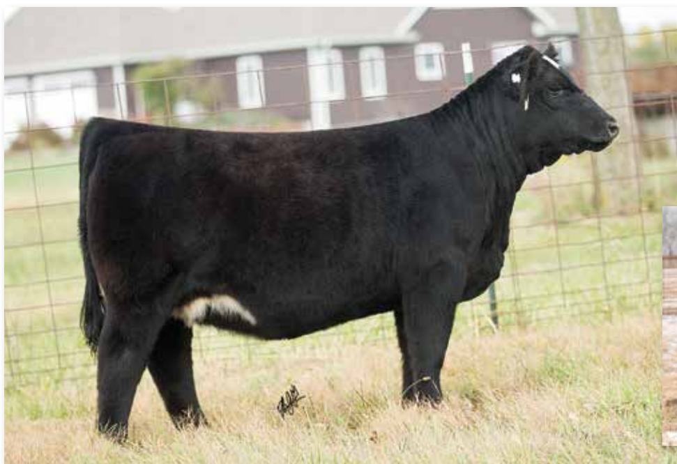
Lot 5 RUBY NFF RHYTHM 148J

We really liked the Blacklist Angus bull when his night pen was next to ours in Denver. Maybe as wide pinned and stout hipped of an Angus bull as I had seen, my only regret is we should have tried him on 2124Z sooner. This white faced SimAngus female is really nice. Great structure. extra body, extra dimension, extra good haired. We think she will be super competitive. If you make it to the farm, let us show you her flushmate brothers and you will like her even more.