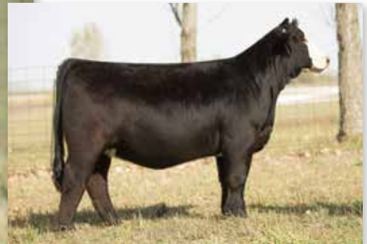
RUBY'S RHYTHM 048H - FULL SISTER TO LOTS 7-9