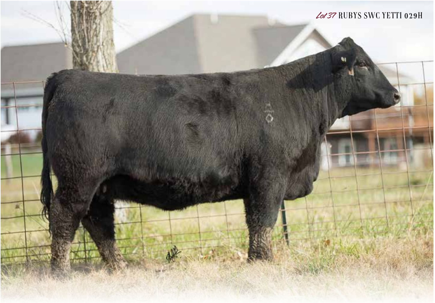
Lot 37 RUBYS SWC YETTI 029H