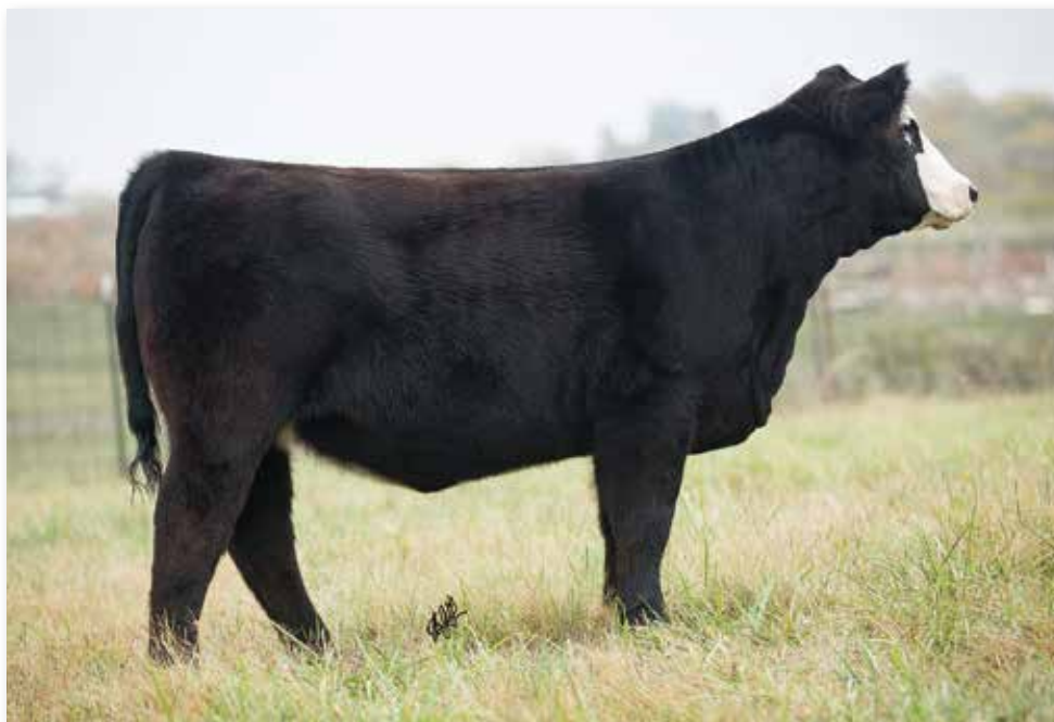
Lot 23 RUBYS TABBY 106J

Everyone loves a baldy! Especially a good haired, big boned, cool looking one. A real good full sister sold to Larry Stouder last year and a 3/4 sister was a past high seller in this sale. The 361A cow maybe on of the most unheralded cows in our operation. She brings in a good one year in and year out. No flush work, just the old fashioned way. If you want to put one in your herd that can do the same, this would be a logical place to start.