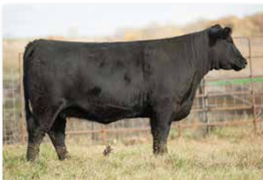
Lot 54 RUBYS ROSETTA 9G1