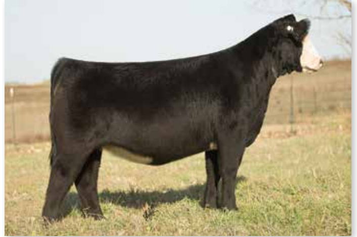
RUBY NFF RHYTHM 086H - FULL SISTER TO LOTS 1-4