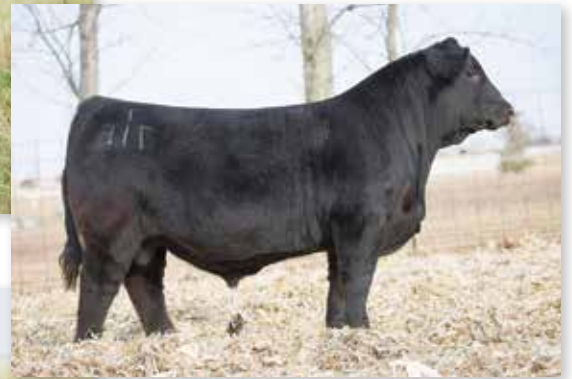
RUBYS TURNPIKE 771E - SIRE OF LOTS 16 & 17