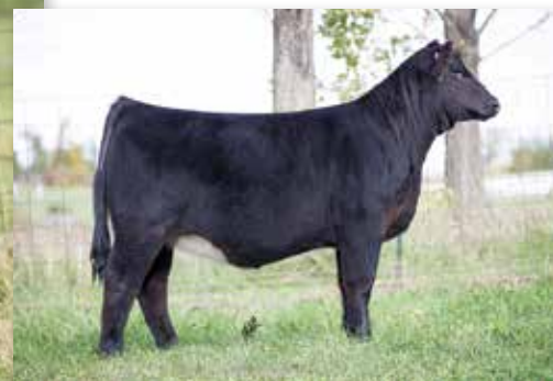
RUBY NFF RHYTHM 810F MATERNAL SISTER TO LOTS 1 - 5

A little extra chrome will always get you noticed and hopefully her quality will get noticed too. She is cool looking, correct, and angular as her picture shows. Imagine some SimAngus cattle out of this one!