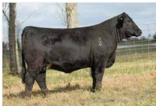
Lot 56 RUBYS KIMBERLY 0136H