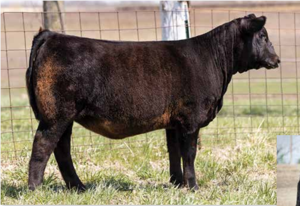
Lot 6 RUBYS ROSETTA 1J47