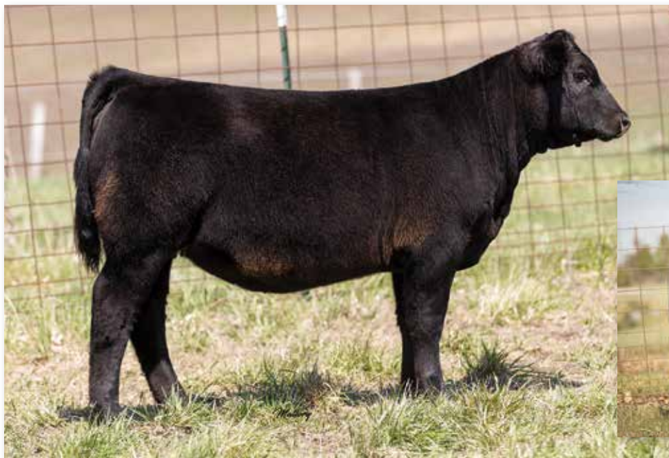
Lot 2 RUBYS ROSETTA 1J36