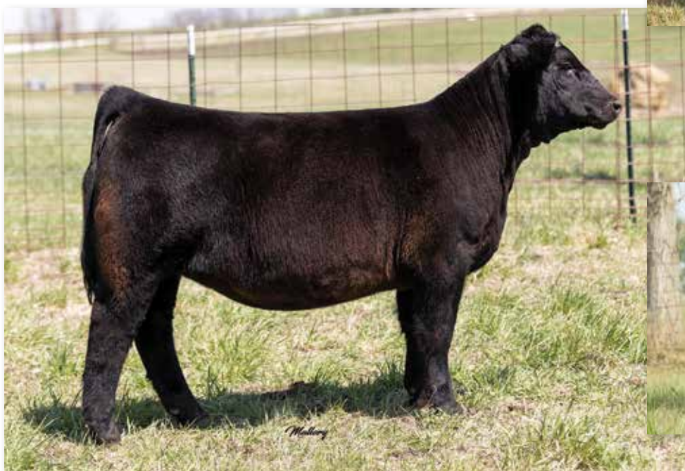
Lot 15 RUBYS RHYTHM 1J27