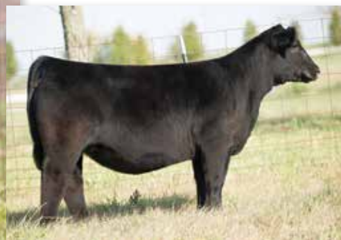
RUBY'S YOKO 110J MATERNAL SISTER TO LOT 17

Another one that is getting noticed amongst the visitors. Here is one that is very fault free and hard to find a hole in. Its been our experience, those are the best kind. Great looking, big bodied, stout made, and free moving. Her dam is a Style x Steel Force x the great S600. Lots of quality that goes back to a great cow family, she has it all.