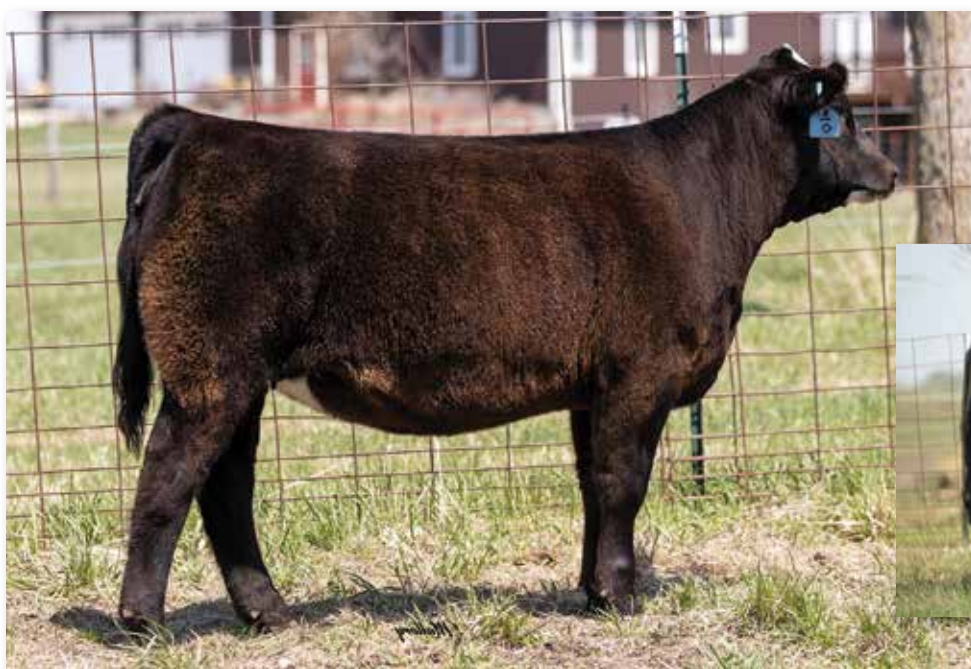
Lot 3 RUBYS ROSETTA 1J55