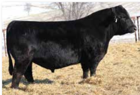
RUBYS TURNPIKE 771E SIRE OF LOTS 27-31

Looking for a donor cow? I always think the ones that breed the best are the ones with the most unique pieces, and that describes this one perfectly. She is really long fronted, stout made, good center body with great big feet and legs. Dig into her pedigree and you will see the great S600 donor is her granddam. Sriracha will flat work on this one, then put her in the donor pen and let her get to work for you.