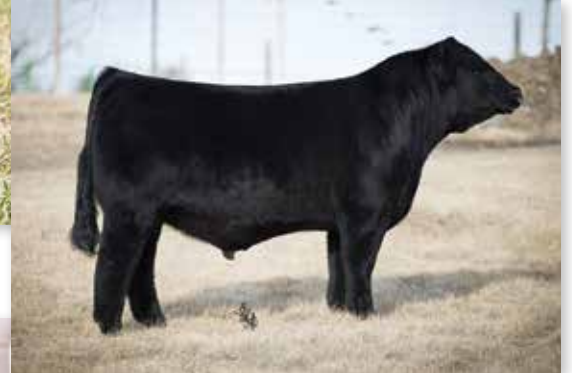
RUBY SWC BATTLE CRY 431B SIRE OF LOT 7