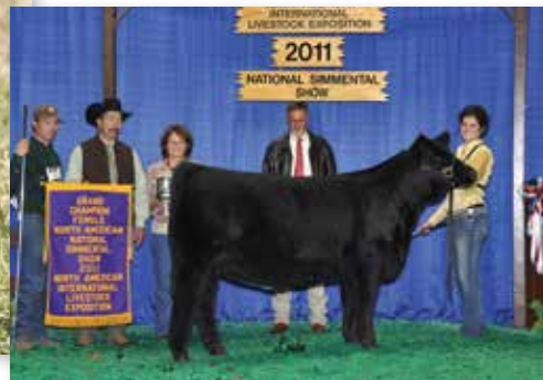
FBFS X-CLAMATION 76X

The youngest female in the offering but one of the best. I could tell at an early age this one was going to be good and she just keeps getting me more excited. She is very loose made, yet still gives you an elite look. For a young heifer, we love her extra body depth and her muscle shape and design. She has extra presence and knows she is good yet is very easy to handle and we think she will be a great project for a first-time exhibitor but with the quality for a last year exhibitor. We love the cow family here too as she goes back to a stunner of an Angus cow. Don't miss this one!