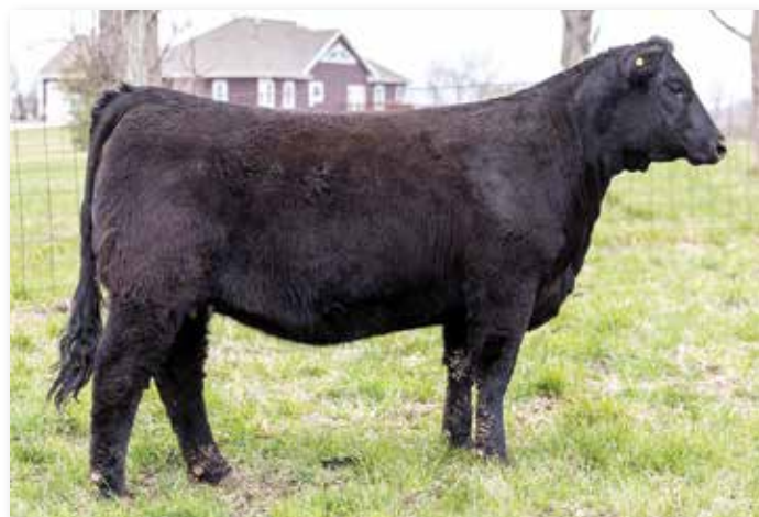
Lot 32 JSUL MARY INFLUENCE 0536H

Dam PVFS RUBY MADDEN 126Y RUBYS ROSETTA 3186A FCC ROSETTA 974T