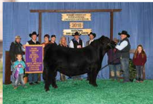
WLE COPACETIC E02 - SIRE OF LOTS 8-10