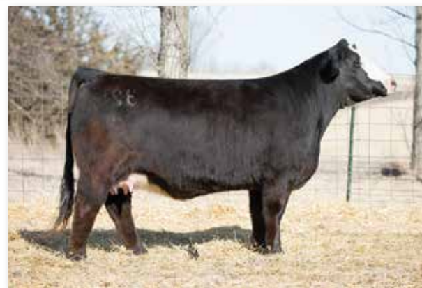
RUBYS MAGNETIC LADY 328A - DAM OF LOT 21