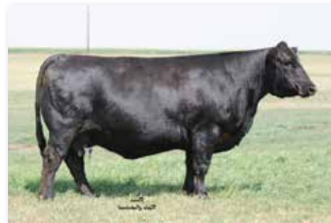
THSF MS LIBERTY S600 INFLUENTIAL MATERNAL GRANDDAM OF LOT 28