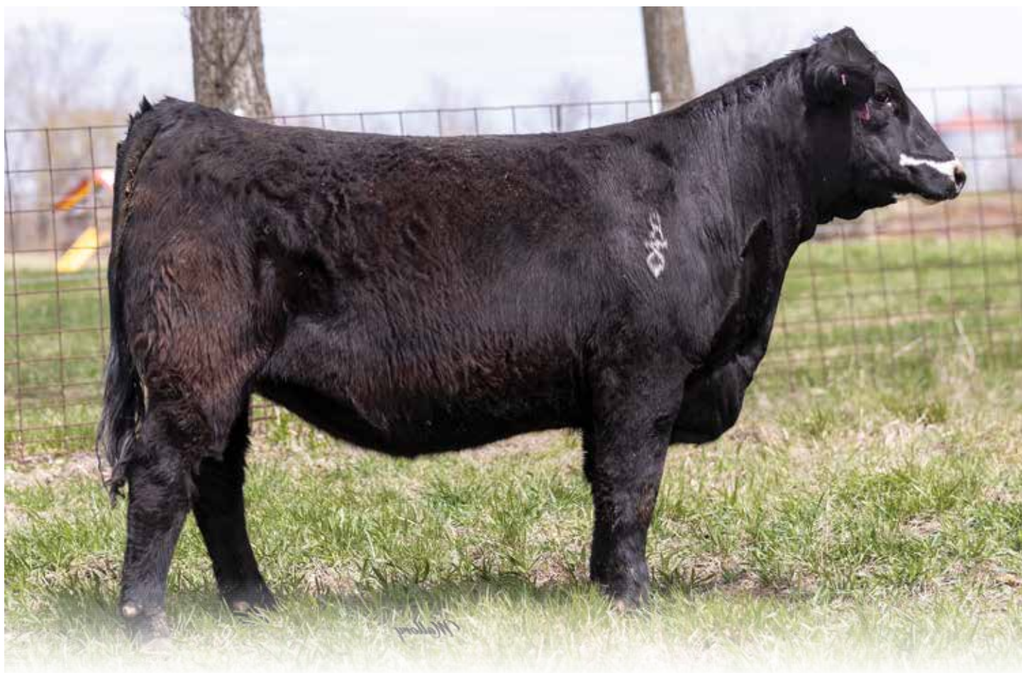
Lot 19 RUBYS ROSETTA H0059

We are starting the bred division the same way we start the opens, with two high quality donor prospects. The 324A flat get it done and we love how they do nothing but get better as they mature. The blaze faced is as freaky necked as anything we have offered for a while but is still soft sided and great on the move. The brockle face offers more power and bone, yet still good looking and complete in her makeup. Ask anyone who has the Sriracha calves and you find the customer satisfaction is high. He is a fresh breath of calving ease genetics that still brings excellent phenotype to the equation. We are excited for the future of this young sire!