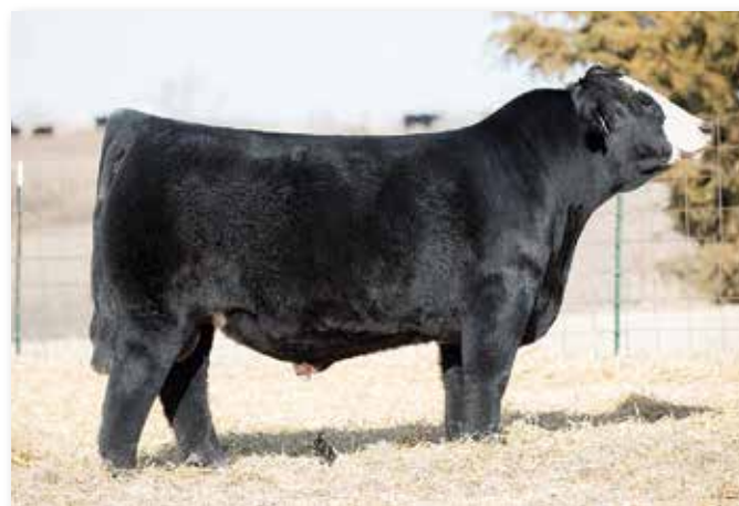
RUBY/SWC GENTLEMAN'S JACK - SIRE OF LOTS 1-3 & 14-15