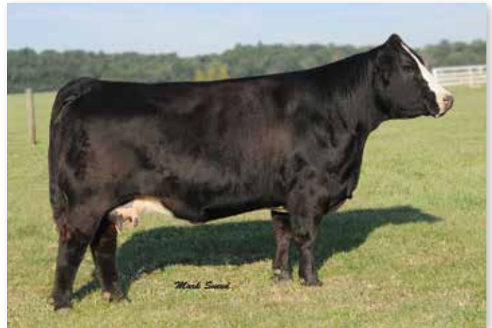
DOUBLE R SHESTHEONE K18 - MATERNAL GRANDDAM OF LOT 18

You will notice the dam of this female is an In Dew Time x K18. That mating help put us on the map and the Y124 cow is one of the best from that mating. Her Currency daughter has been a good one since she hit the ground. She is just so complete in her design, yet has that extra look and presence to grab you eye. She has a great attitude and would be a great choice for a first time exhibitor as well.