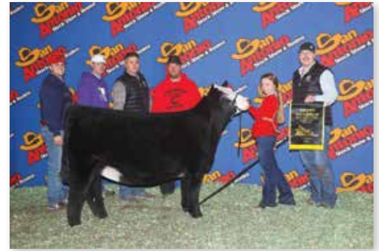
2019 SAN ANTONIO LIVESTOCK SHOW GRAND CHAMPION PUREBRED SIMMENTAL HEIFER MEMBER OF THE "CINDA" COW FAMILY!