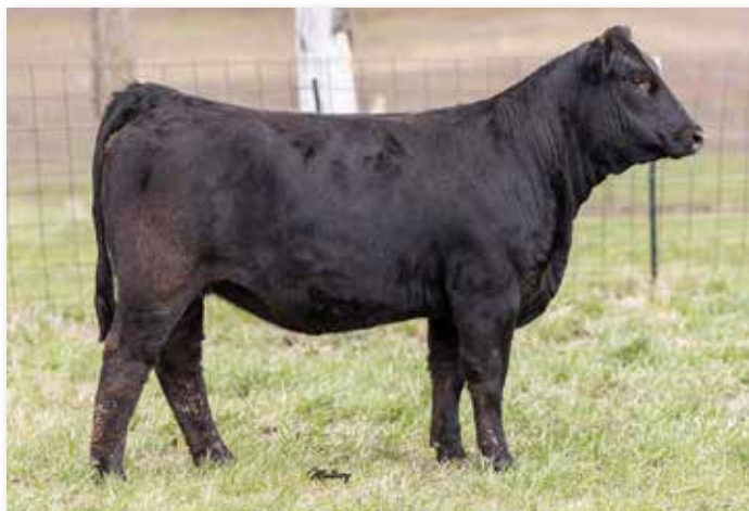
Lot 27 RUBYS LINDA H0053