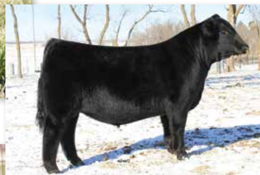
RUBY'S CURRENCY 7134E $435,000 SIRE OF LOTS 4-6