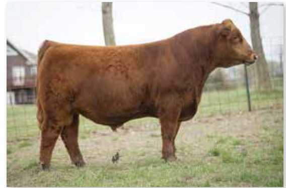
KBHR SRIRACHA H127 - SERVICE SIRE