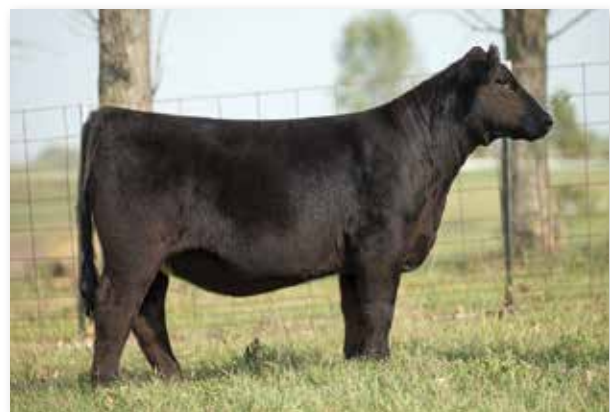
RUBY'S ROSETTA 0118H - FULL SISTER TO LOTS 19 & 20