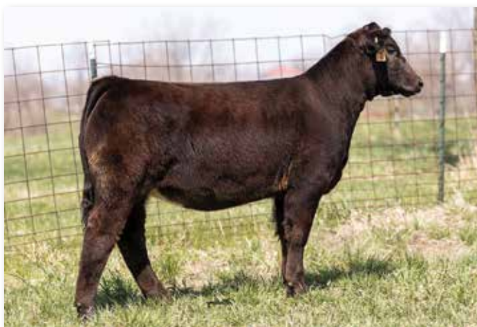
Lot 11 RUBYS RHYTHM 1J13