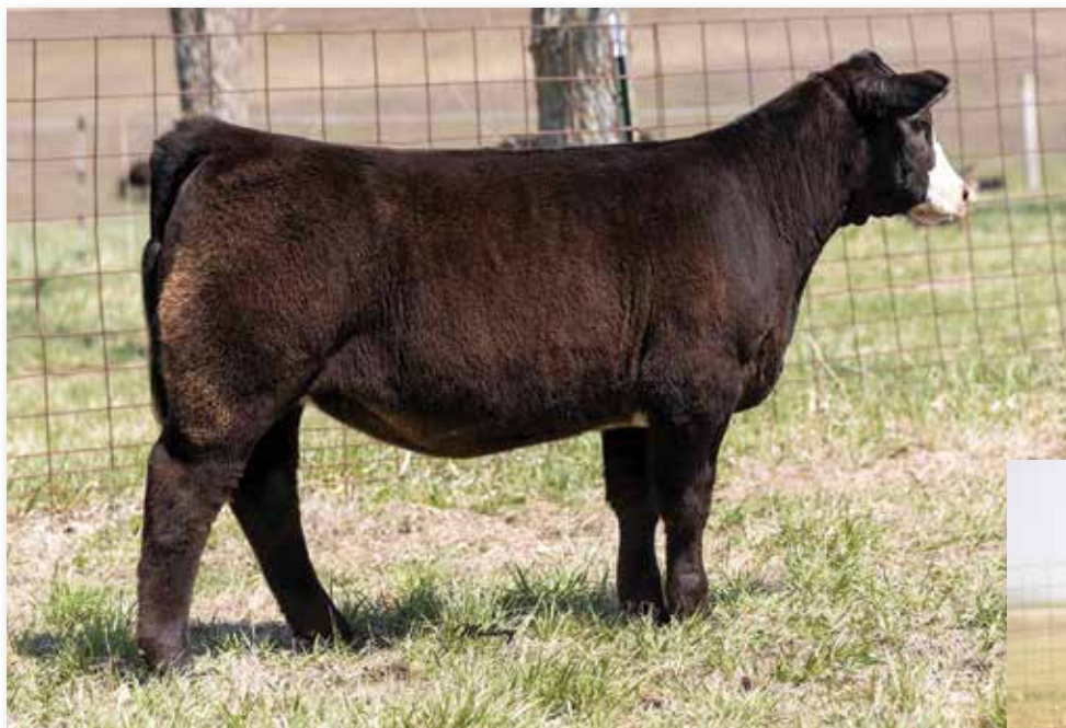
Lot 14 RUBYS RHYTHM 1J37

I really like these two Jack females. They are long fronted, long bodied, have great hair and have great presence. They have that it factor that grabs your attention when your walking around the pen. The Jack females have been getting it done in production as well. One of my favorite females in our fall sale was out of a Jack daughter. Make sure you study these sisters.