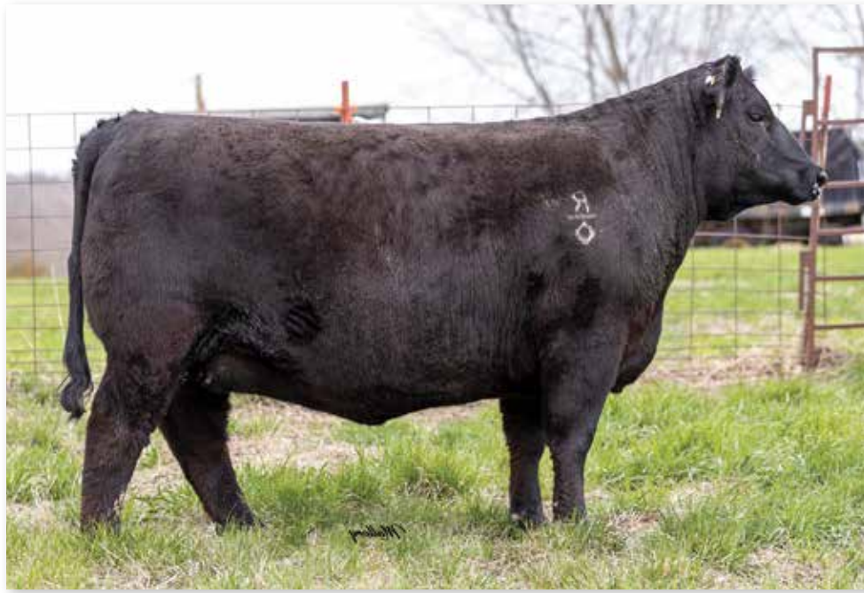
Lot 37 RUBYS JUANADA 0144H