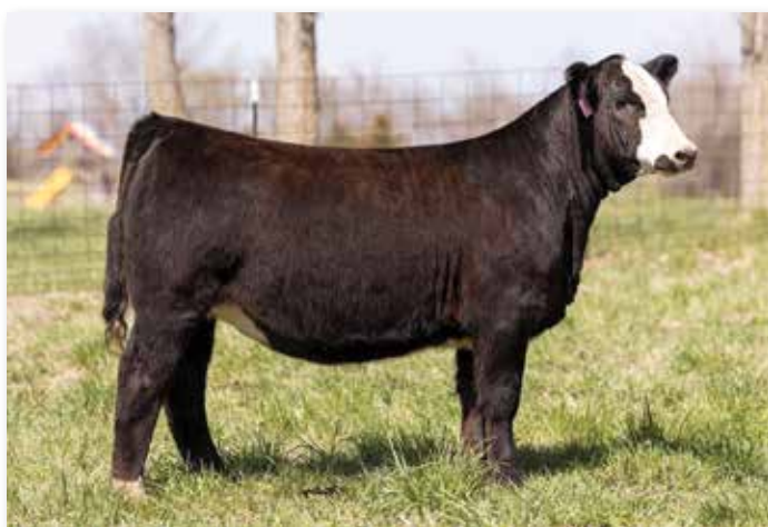
Lot 13 RUBYS RHYTHM J1110

Extra power and length of body in this Currency daughter. She is big footed and big legged and long necked. One that is a bit later in her maturity pattern. I love all her pieces and think her best days will be as a bred female next summer. She is plenty good right now, but I think her future is really bright.