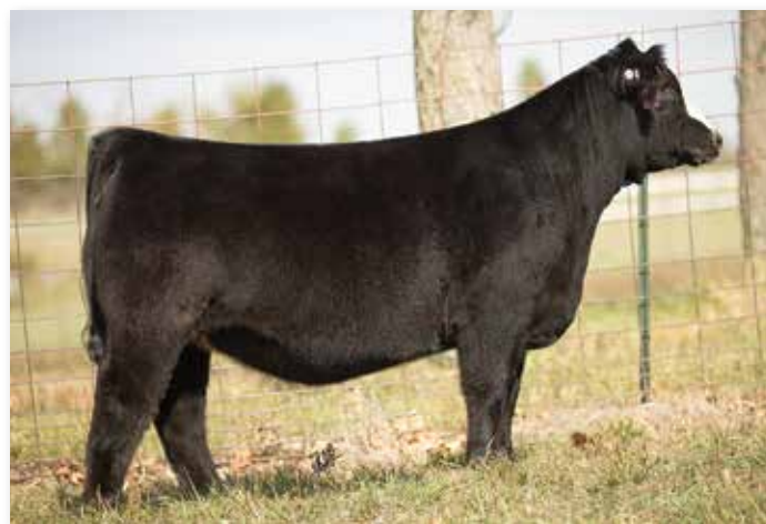
RUBY'S ROSETTA 0134H - FULL SISTER TO LOTS 19 & 20