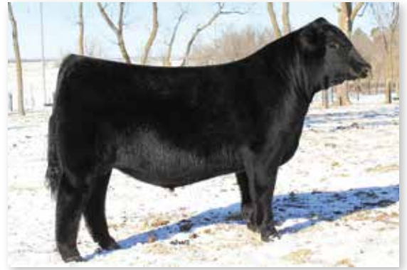
RUBY'S CURRENCY 7134E - $435,000 SIRE OF LOTS 22-26