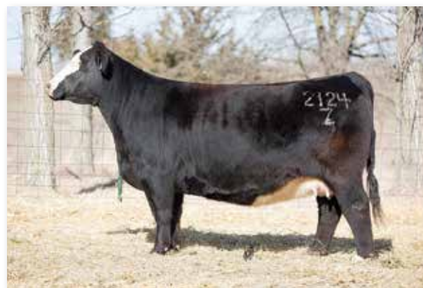
RHYTHM 2124Z - MATERNAL SISTER TO THE DAM OF LOT 24