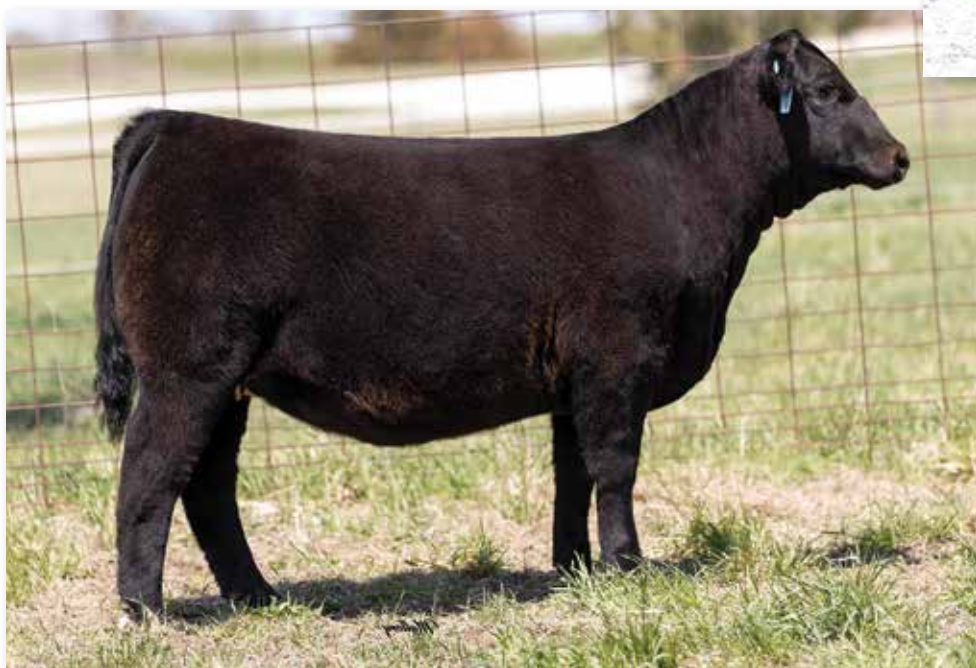
Lot 5 RUBYS ROSETTA 1J63