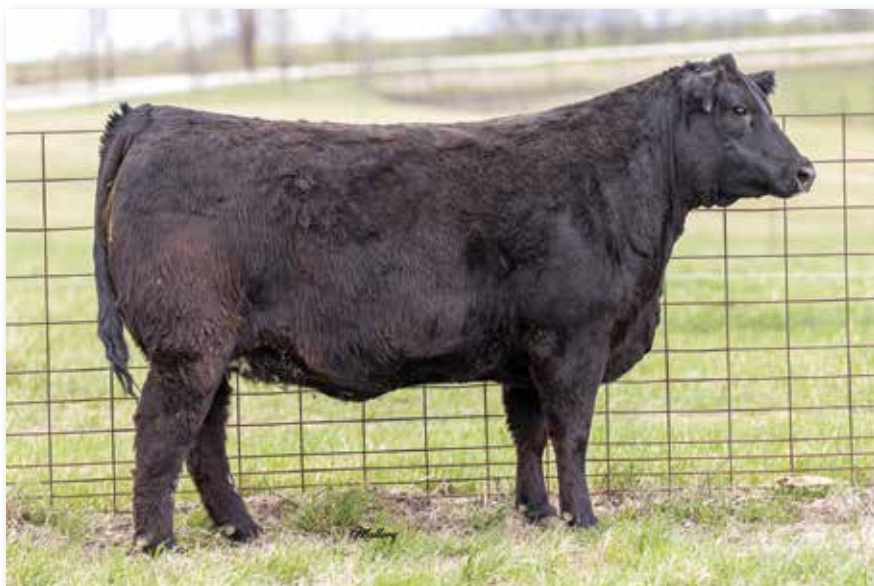
Lot 44 RUBYS RHYTHM 006H

Style x Rhythm. Not much more needs to be said but predictable and profitable on both sides of the pedigree. You will like her Sriracha calf!