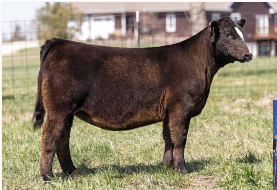
Lot 16 RUBYS ROSETTA 1J79

The youngest female in the offering but one of the best. I could tell at an early age this one was going to be good and she just keeps getting me more excited. She is very loose made, yet still gives you an elite look. For a young heifer, we love her extra body depth and her muscle shape and design. She has extra presence and knows she is good yet is very easy to handle and we think she will be a great project for a first-time exhibitor but with the quality for a last year exhibitor. We love the cow family here too as she goes back to a stunner of an Angus cow. Don't miss this one!