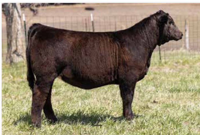
Lot 12 RUBYS RHYTHM J1107

Currency has worked really well on the 715E donor. This is her natural calf and has been a favorite since very early on. She is as freaky necked as you can make one and gives you that wow factor when you walk in the pen. She is stout and square with a real good running gear as well. She is built for the long haul and I think her future is really bright. What a senior yearling she will make!