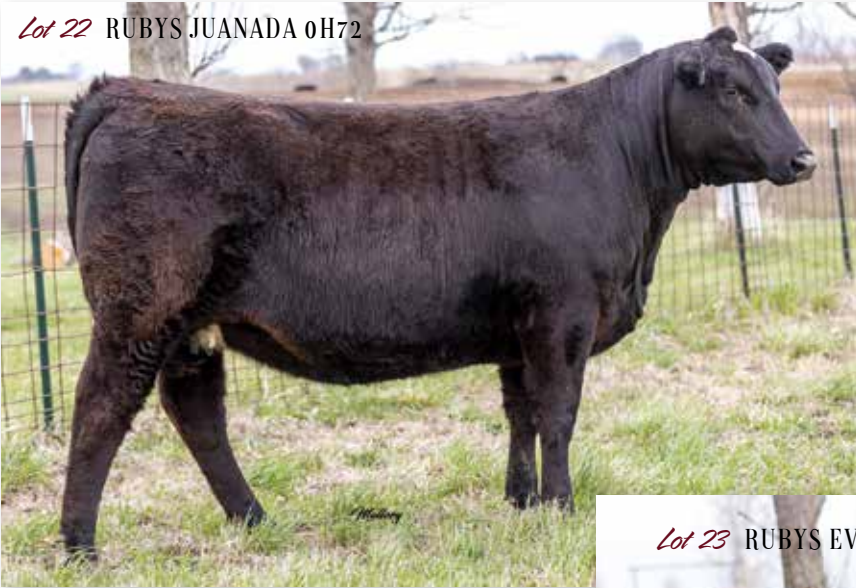
Lot 22 RUBYS JUANADA 0H72