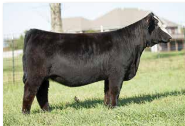
RUBY BRUP MAG LADY 945G - MATERNAL SISTER TO LOT 21