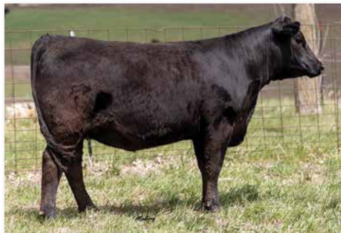
Lot 40 RUBYS JUANADA 0H79