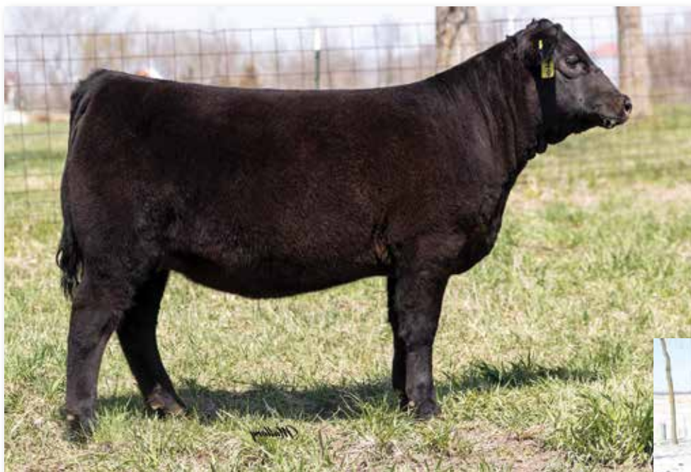
Lot 4 RUBYS ROSETTA 1J66