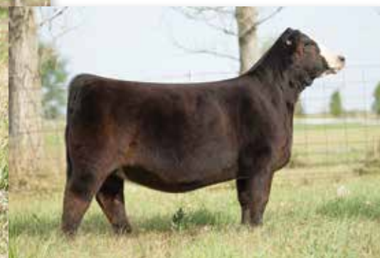
RUBYS RHYTHM 104J - FULL SISTER TO LOT 14 &amp; 15