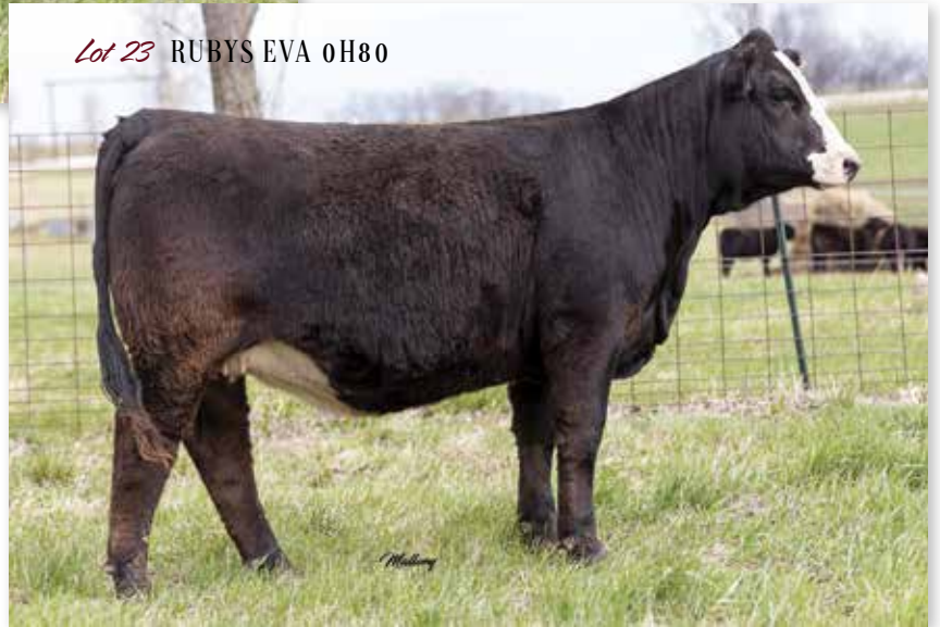
Lot 23 RUBYS EVA 0H80