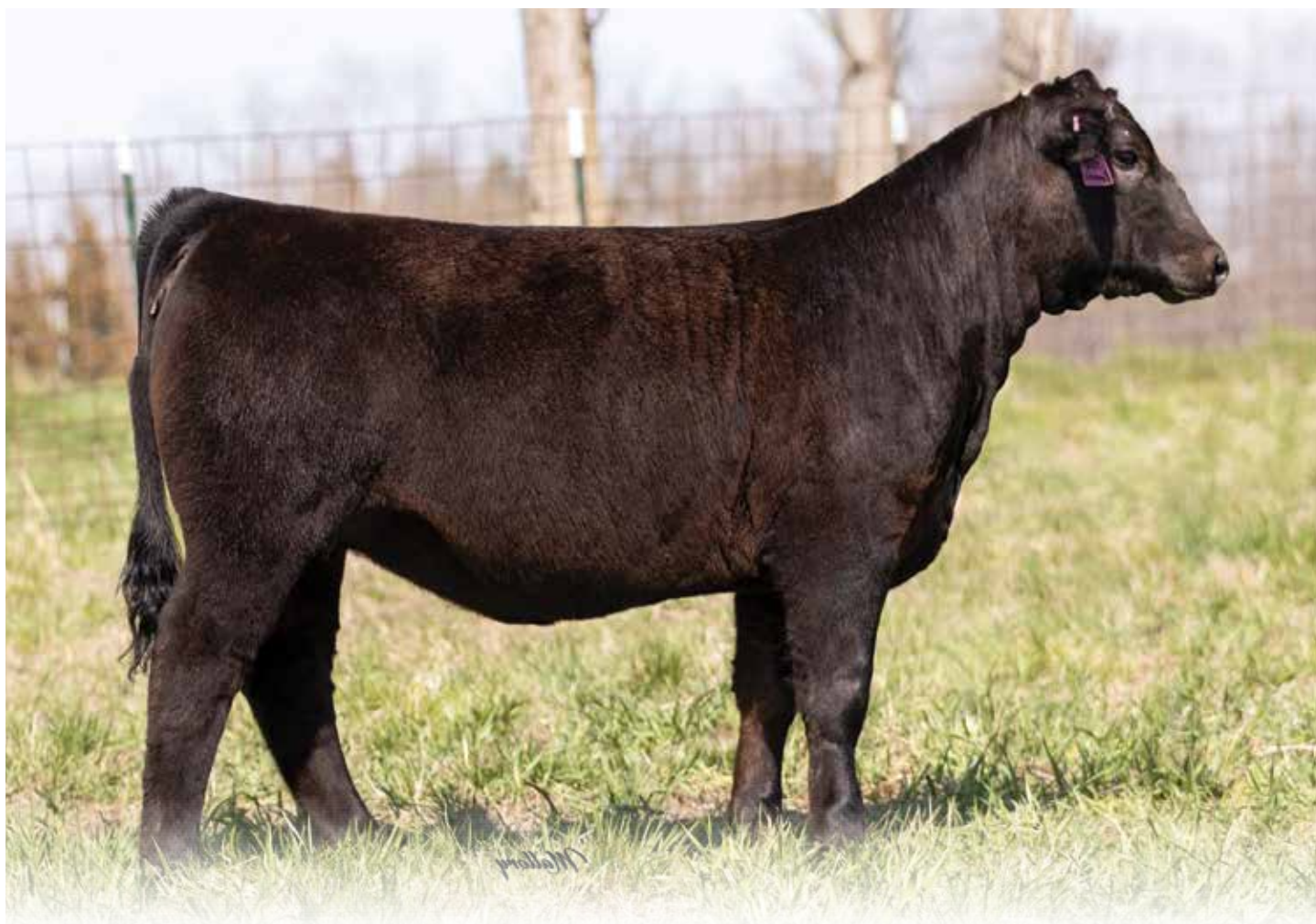
Lot 8 RUBYS RHYTHM J1102

The 715E donor always reminded us of a modern version of her famous dam. In production, she is proving to hold her own and is making a name for herself. These Copacetic daughters have the capability of launching their dam into stardom. We love these three heifers and they have been favorites of early visitors. They are cool fronted, square hiped with extra pin width, have big feet with great flexibility and more than enough center body. These are the kind that are getting noticed in the show ring right now and they are the right kind for sure. Here is your chance to add some Rhythm genetics into your operation and still have a whole lot of fun in the process.