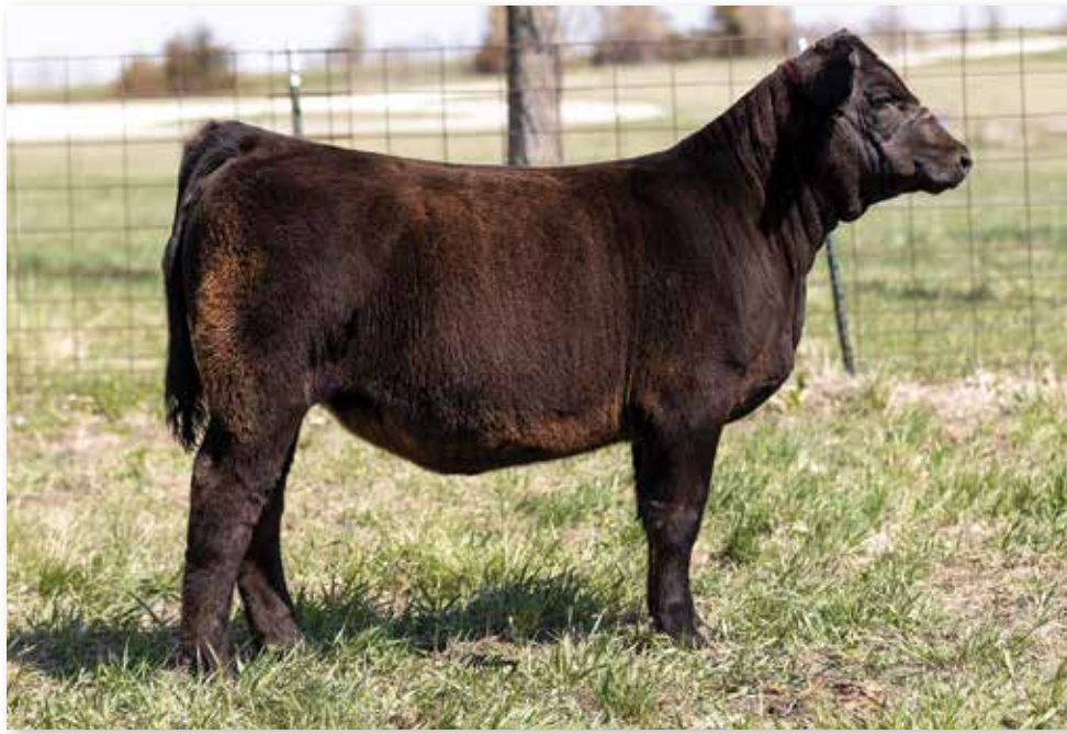
Lot 18 RUBYS RHYTHM 1J26