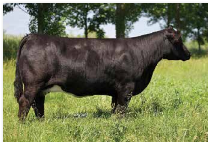
RHYTHM 418P - LEGENDARY MATRIARCH OF THE "RHYTHM" COW FAMILY!