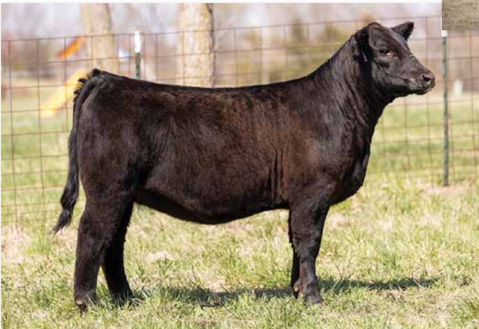
Lot 7 RUBYS ROSETTA J1100