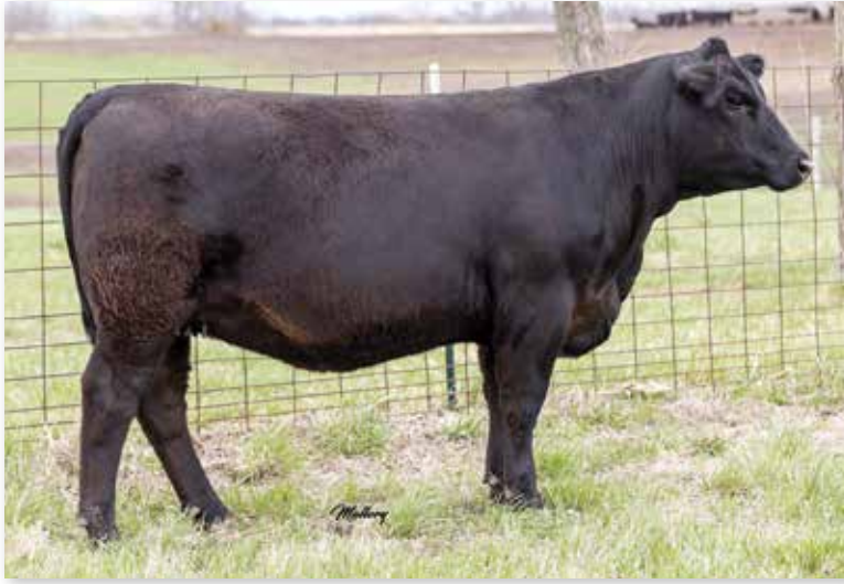
Lot 38 RUBY NFF LASS 0H67

These next five SimAngus females are ones to build around. If you have followed our program, you know how much I love the Cash Flow cattle. They have great feet, are sound structured, are good looking, with good body depth and rib shape with added muscle and power. Come calving time, they are great mothers that calve unassisted and have great udders. Take a long look at these girls if your wanting to upgrade your cow herd, we hate to see them leave.