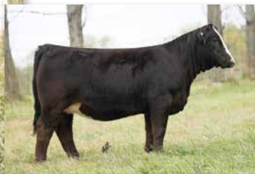
RUBYS RHYTHM 189J - FULL SISTER TO LOTS 8-10