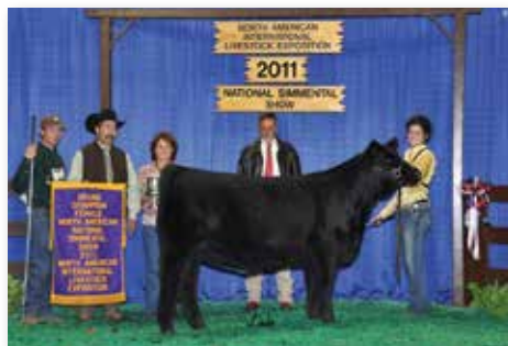
FBFS X-CLAMATION 76X - 2011 NAILE GRAND CHAMPION AND MATERNAL SISTER TO LOT 28