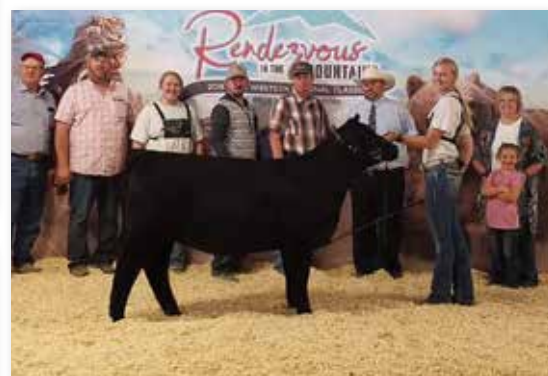
2019 AJSA WESTERN REGIONAL GRAND CHAMPION PERCENTAGE SIMMENTAL HEIFER FULL SISTER TO LOT 44

This one has been a standout since a young age and is one of my favorite breds. I wish I could tell you a big long story about her cow family but truth be told she is out of a Hereford/Angus cow. With that being said, this is the kind that can start her own cow family story. I love her look, structure, softness and power combined with a cool brockle face. She has always been the high performing animal amongst her contemporaries as well. Don't miss this one!