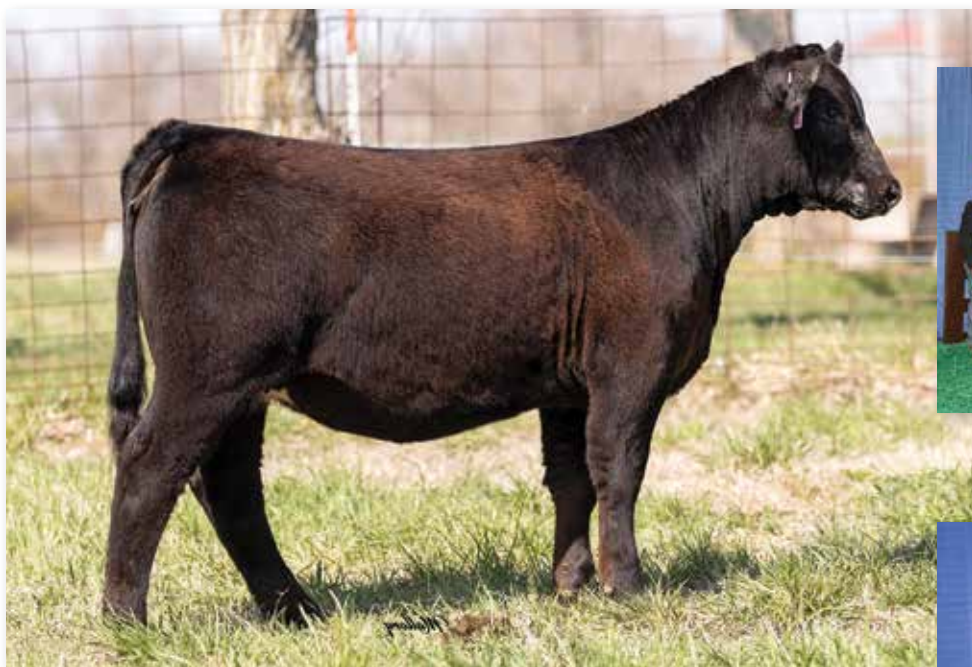
Lot 9 RUBYS RHYTHM J1105