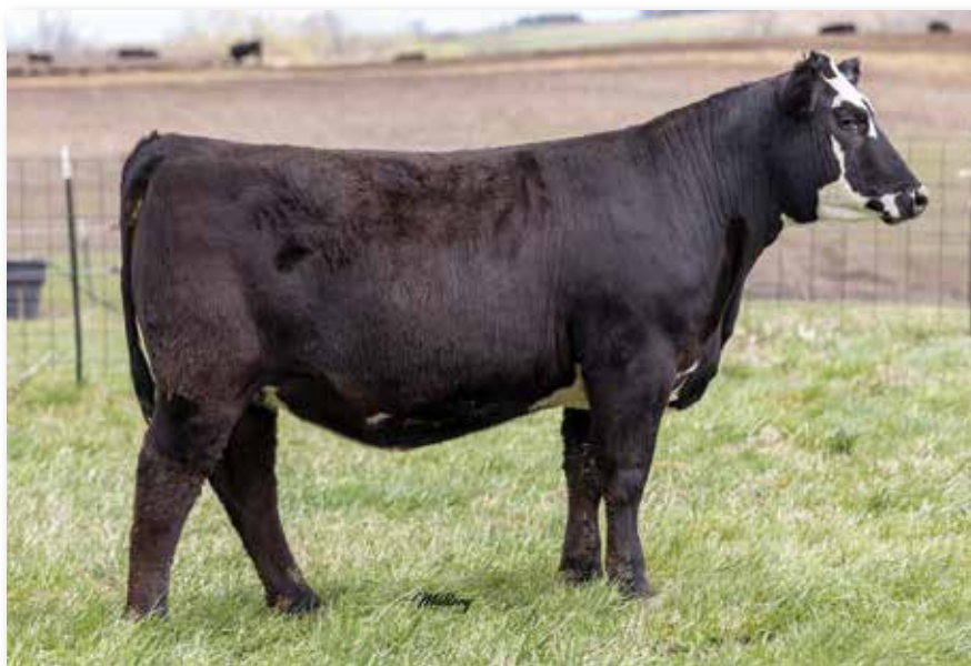
Lot 43 RUBYS MISS 0H83

This one has been a standout since a young age and is one of my favorite breds. I wish I could tell you a big long story about her cow family but truth be told she is out of a Hereford/Angus cow. With that being said, this is the kind that can start her own cow family story. I love her look, structure, softness and power combined with a cool brockle face. She has always been the high performing animal amongst her contemporaries as well. Don't miss this one!