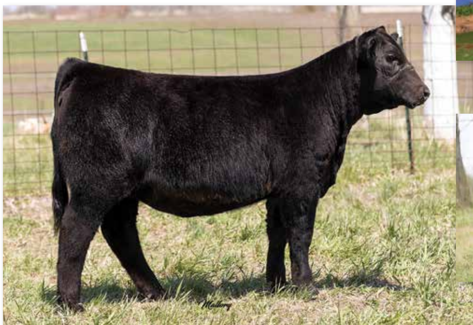
Lot 10 RUBYS RHYTHM J1106