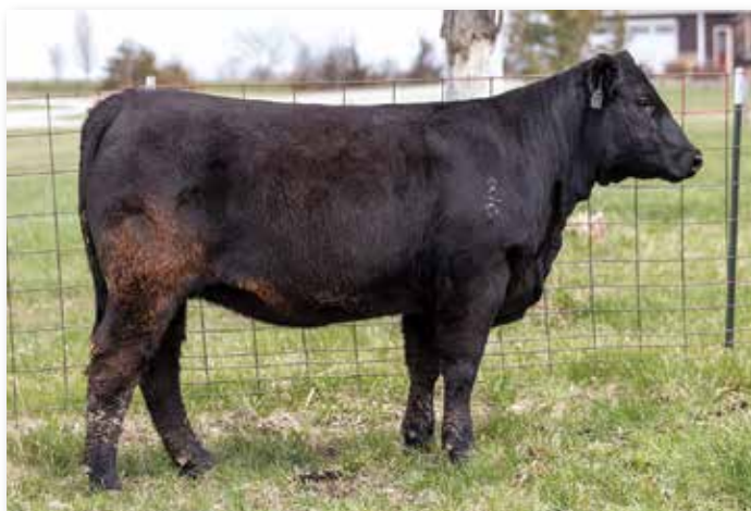
Lot 31 RUBYS ROSETTA 0H20