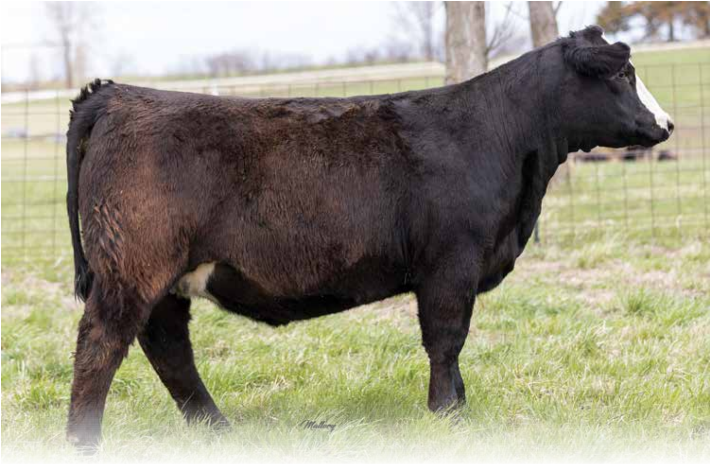
Lot 20 RUBYS ROSETTA H0056