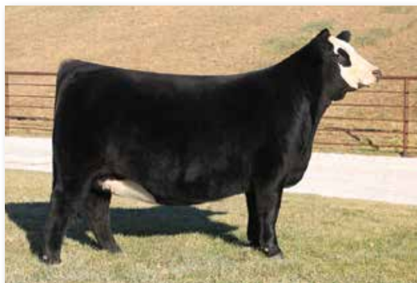
JBSF PROUD MARY - LEGENDARY MATERNAL GRANDDAM OF LOT 32

This Rosetta family member brings extra power, body length, and performance to the table yet is still loose structured and attractive made. She is bigger in her frame size, yet still has the extra rib shape and body depth to go with it. An interesting breeding piece here no doubt.