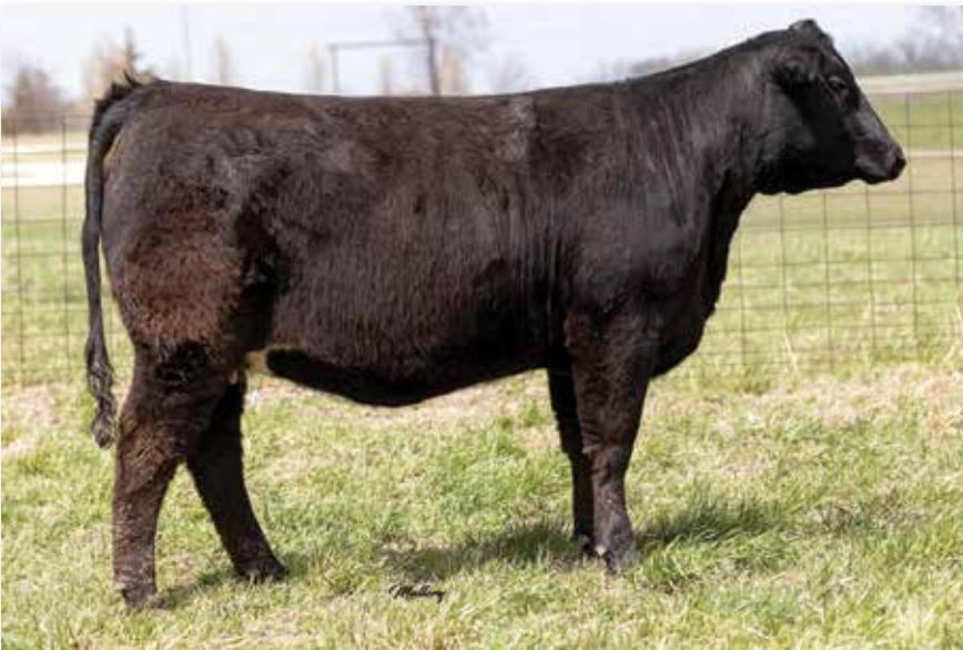
Lot 34 RUBYS CINDA 0H24