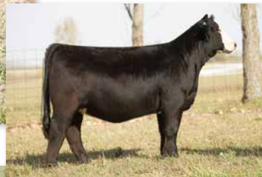
RUBYS RHYTHM 048H - FULL SISTER TO LOT 14 &amp; 15

I really like these two Jack females. They are long fronted, long bodied, have great hair and have great presence. They have that it factor that grabs your attention when your walking around the pen. The Jack females have been getting it done in production as well. One of my favorite females in our fall sale was out of a Jack daughter. Make sure you study these sisters.