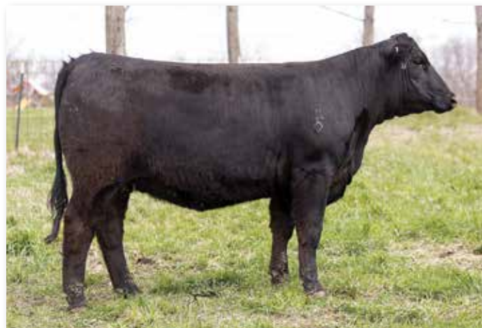
Lot 42 RUBYS MISS 0H66