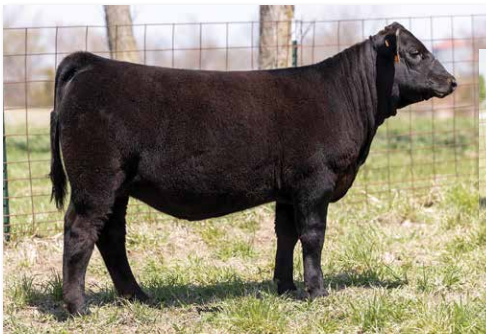
Lot 17 RUBYS YOKO 1J16

2011 NAILE GRAND CHAMPION & FULL SISTER TO DAM OF LOT 17