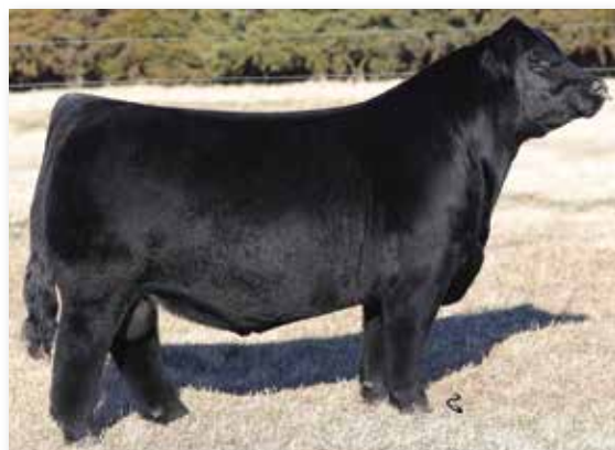
JSUL SOMETHING ABOUT MARY 8421 DECEASED MATERNAL BROTHER TO DAM OF LOT 32

You will notice that this female comes to you with a different pedigree than anything we have offered before. Here is one that will be fun to breed on. She is long fronted, stout made, great haired and sets down on great big feet and legs. Study her pedigree and you will see she goes back to the great Pound Mary female as well. Great cow power here with some really unique pieces to use for the next generation.