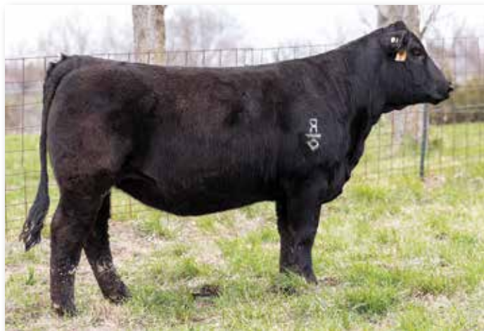
Lot 28 RUBYS LIBERTY 0H13