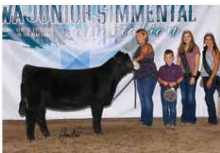
50th Anniversary Simmental Open Show Reserve Purebred Calf Champion