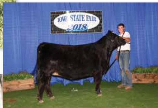
RUBY NFF RHYTHM 715E - DAM OF LOTS 8-15