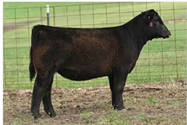
RUBYS ROSETTA H0051 - FULL SISTER TO LOTS 19 & 20